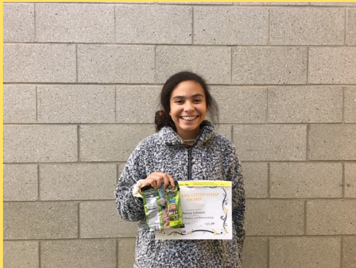
COWS Pics from 11-15