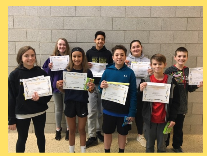
COWS Pics from 11-8