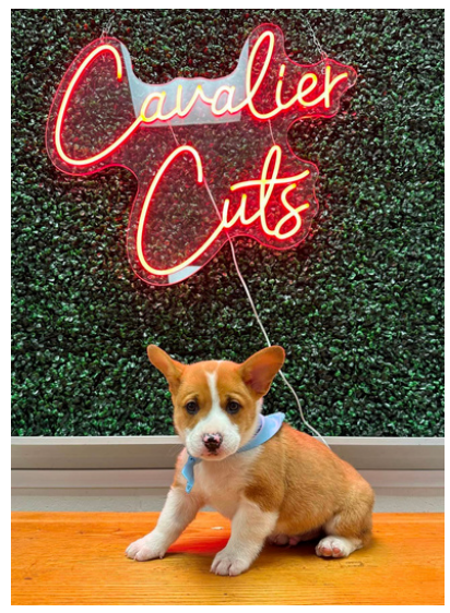
Above: Services are available for the smallest dogs...