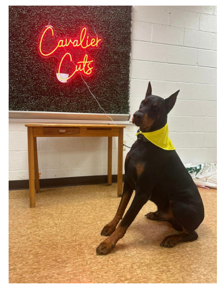
Above: To large dogs.