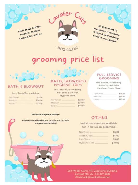
Above: The price list for services offered at Cavalier Cuts.

Left: This highly-satisfied customer invites you to try out Cavalier Cuts!