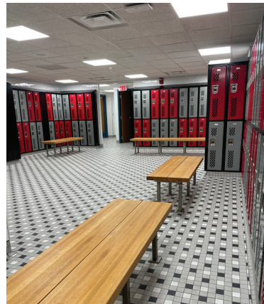
NEW MIDDLE SCHOOL LOCKER ROOM