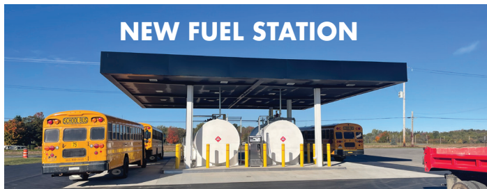
NEW FUEL STATION