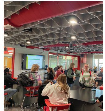
NEW AG-TECH CLASSROOM