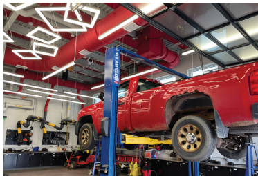
NEW AG-TECH WORKSHOP