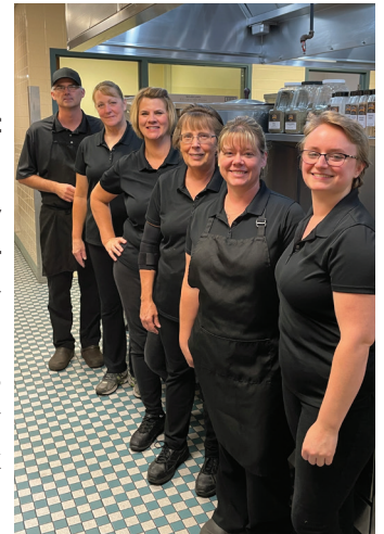
Pictured above is LCS Food Service Dept.