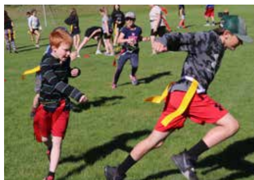
Westwood Elementary Activity Day.