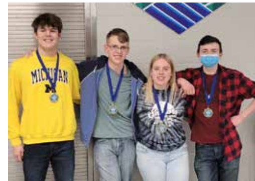
Zimmerman HS/MS Knowledge Bowl Team captured the Granite Ridge Conference Championship.