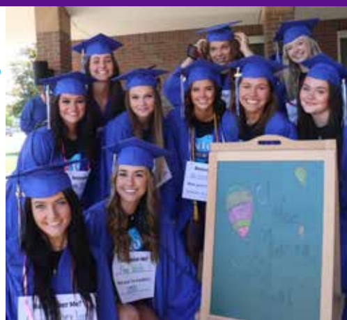
RHS 2022 Graduates joined together to walk the halls of their youth at Rogers Elementary School.