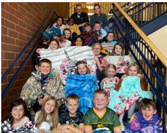
Twin Lakes Elementary Student Council made blankets to donate to Guardian Angels.