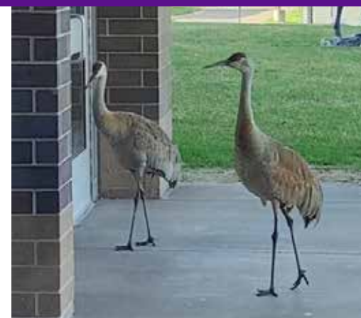
Meadowvale Elementary & Elk River High had a couple of interesting visitors back in May!