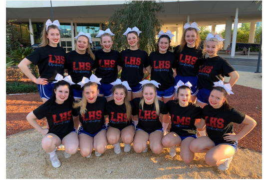
Lakewood Cheer attended the 2022 Citrus Bowl.