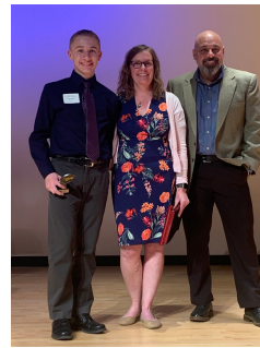
Congratulations to these outstanding award recipients: