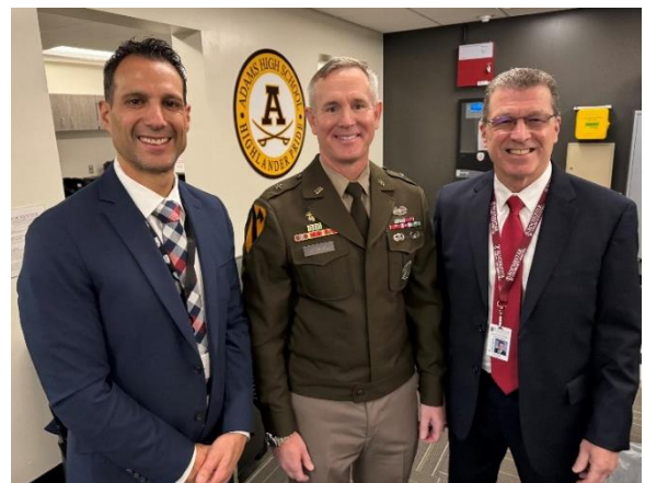
Photo credit: Rochester Community Schools Cusumano, Cushing and Silveri