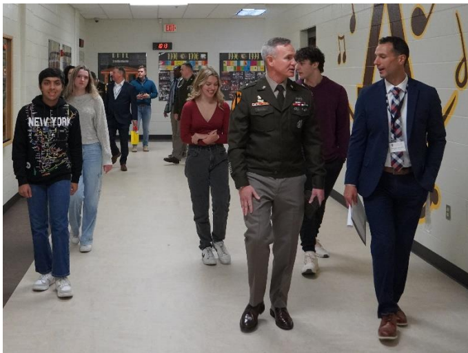
Walking the hallways of Rochester Adams High School