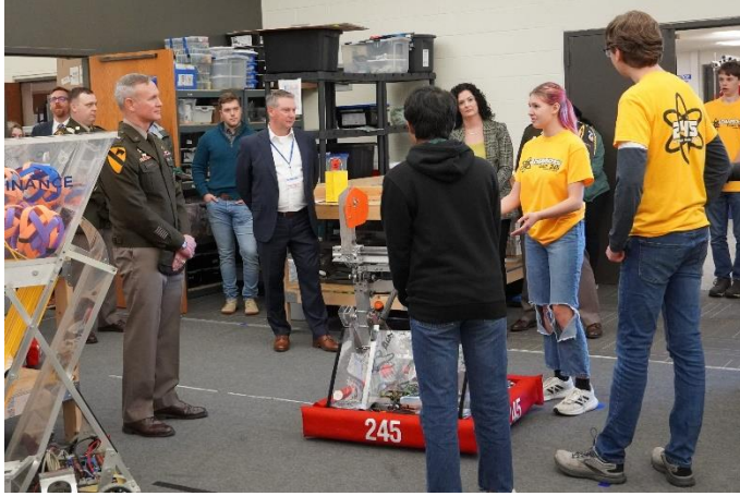
Engaging with AdamBots robotics team