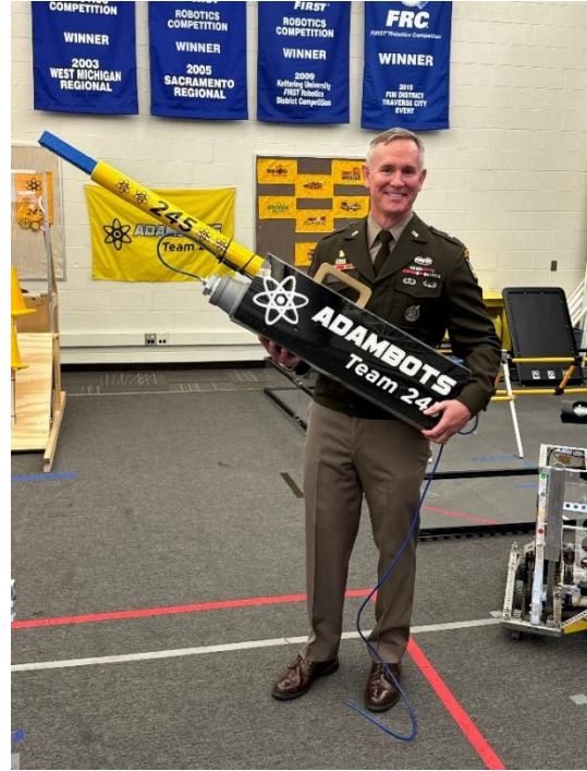
Cushing poses with AdamBots t-shirt cannon