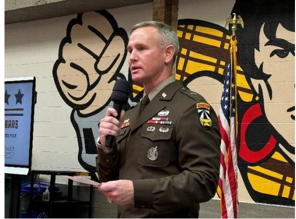
Cushing addresses students, staff and families