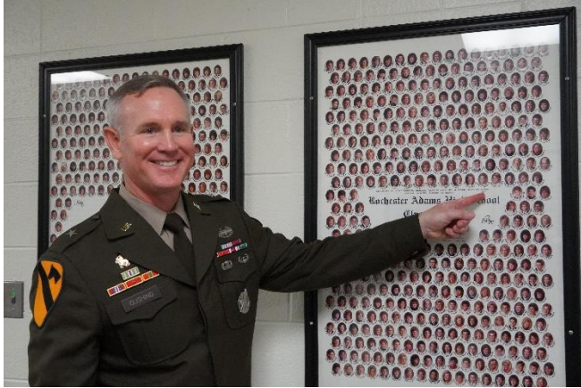
Cushing locates his photo in the '89 class composite