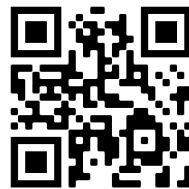
La ola del lago at Grainwood video