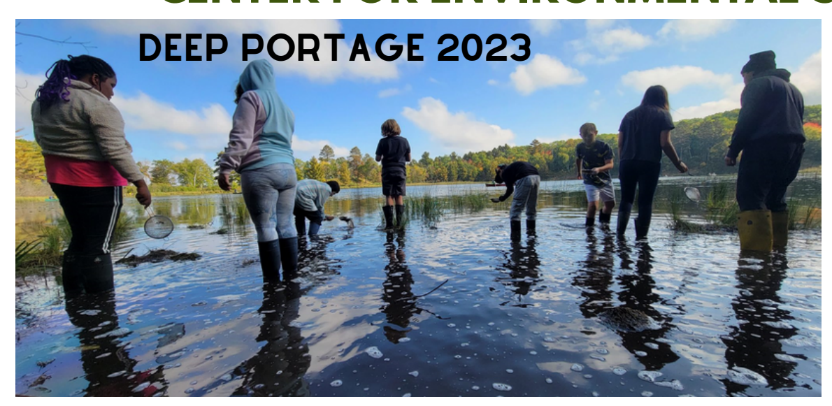
Dear RMS-CES Families,

We have wrapped up our short week ahead of MEA break. We will not have school on Wednesday through Friday of this week and we wish you and your family a wonderful fall break filled with memories and laughter. I am grateful for the efforts of staff and students in the classroom and the support of our amazing parents.