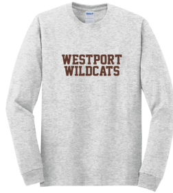
Cotton long sleeve $20