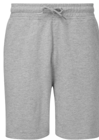
Unisex jogger shorts $28