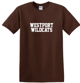
Cotton short sleeve $15