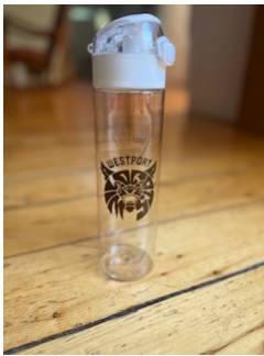
Water bottle $10