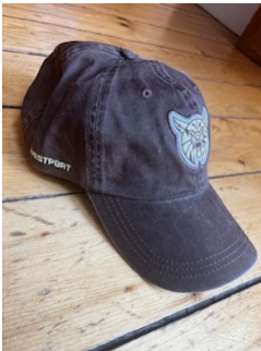
Baseball hat $19