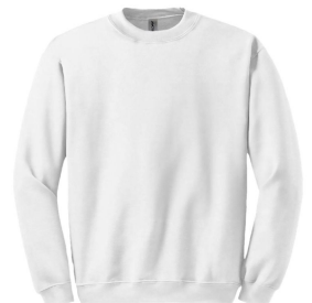
Crewneck sweatshirt $30