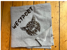
Sweatshirt blanket $35