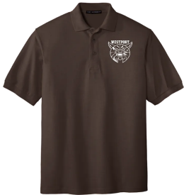
Golf Shirt $30