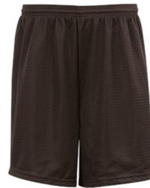
Mesh basketball shorts $28