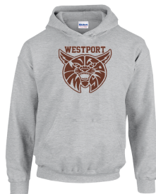
Hooded sweatshirt $35