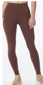
Yoga tights/leggings $30