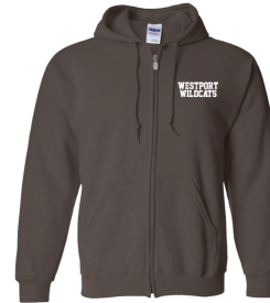
Zip Hoodie $40