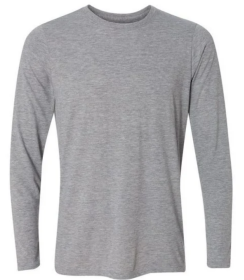
Performance long sleeve $25