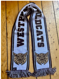
Winter scarf $15