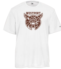
Performance short sleeve $18