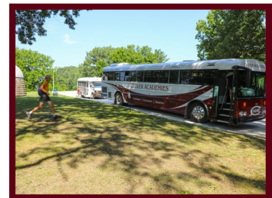
Recent Upgrades in Woodcraft Camp