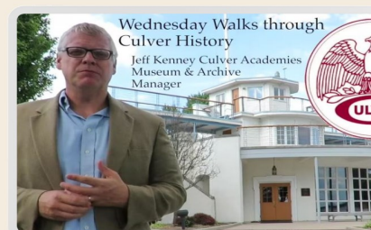
The Culver Naval Building Wednesday Walks through Culver History