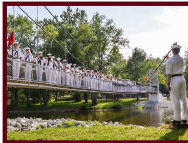
Naval Band plays at Bridge Dedication