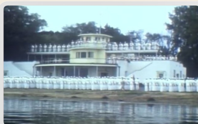
The Naval Building at Culver: Genesis of an Architectural Icon