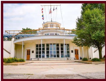
75th Anniversary of the Naval Building