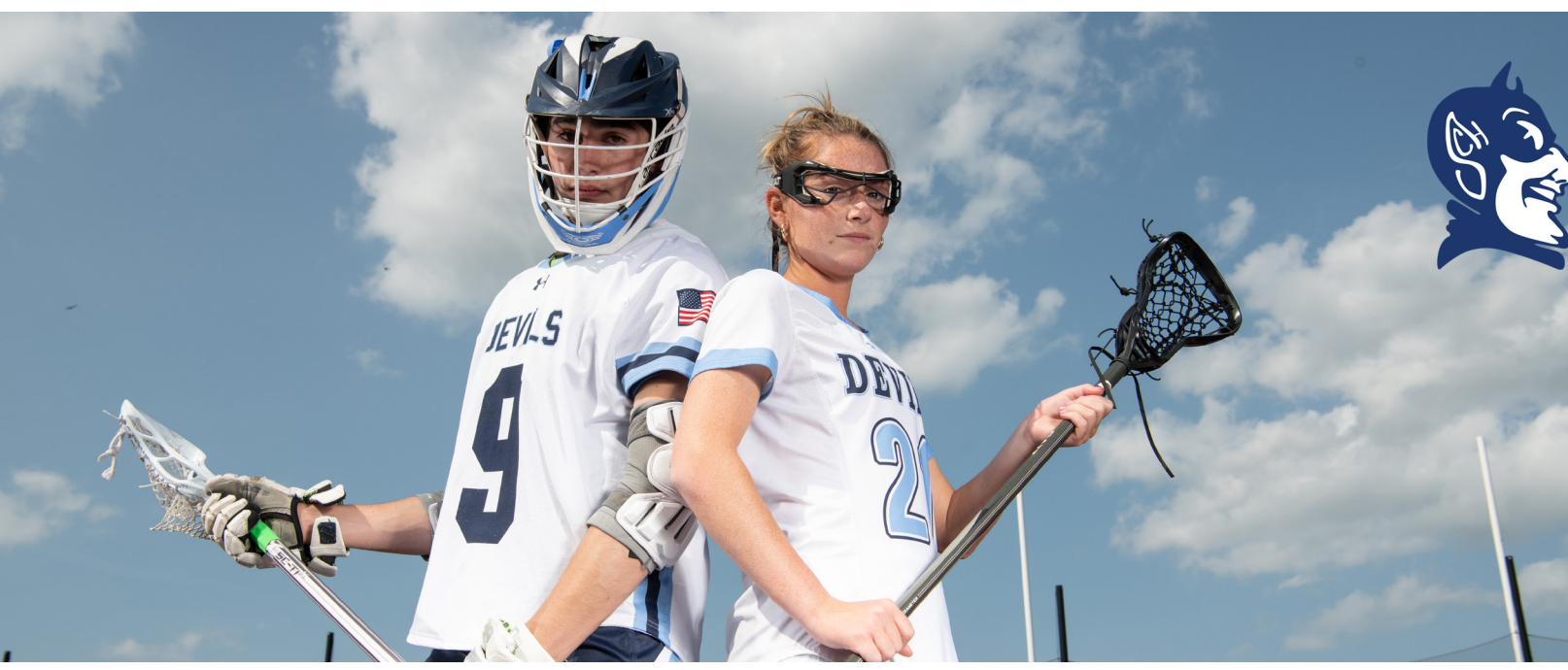
CHECK US OUT AT @SCHACADEMY AND @SCHBLUEDEVILS!

SCH's impressive athletic facilities include a newly renovated fitness center (2023), two multipurpose synthetic playing fields, seven tennis courts, one softball and two baseball fields, a 52,000-square-foot field house, three gymnasiums, two fitness centers, 10 squash courts, an indoor rowing tank, and 20 ergometers.