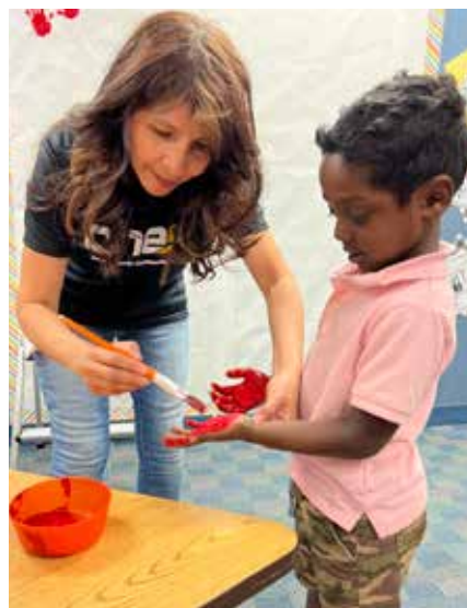
Routines Social Skills Listening Learning