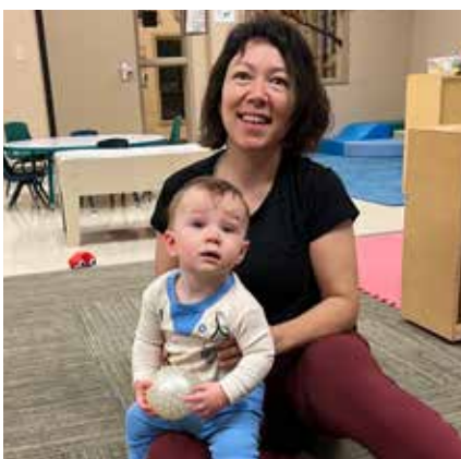
Art & Crafts Science & Math Sensory Play Stories