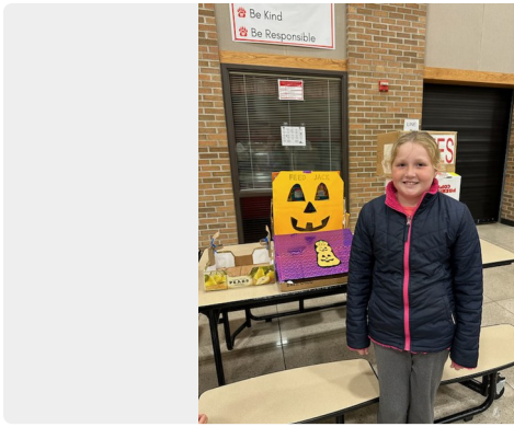
Halloween has arrived - Say Hello to Jack