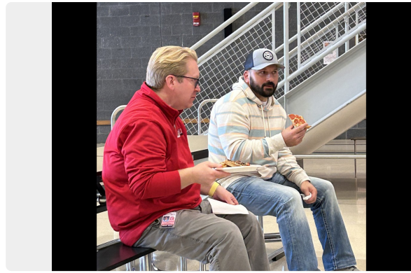
Did somebody say lunch?