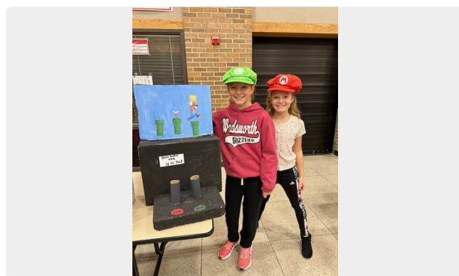
A little Mario anyone?