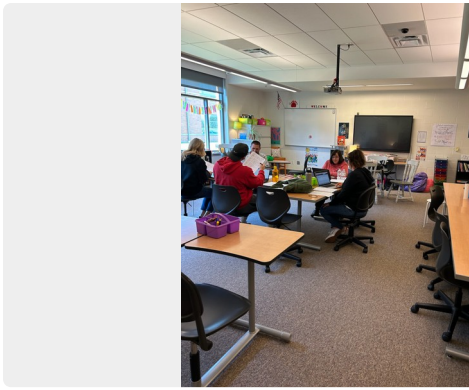
Focused on Writing WEPS