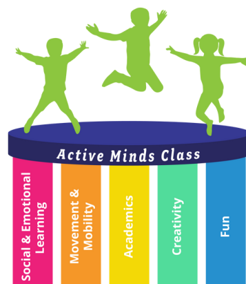
AMC 5 PILLARS OF DEVELOPMENT