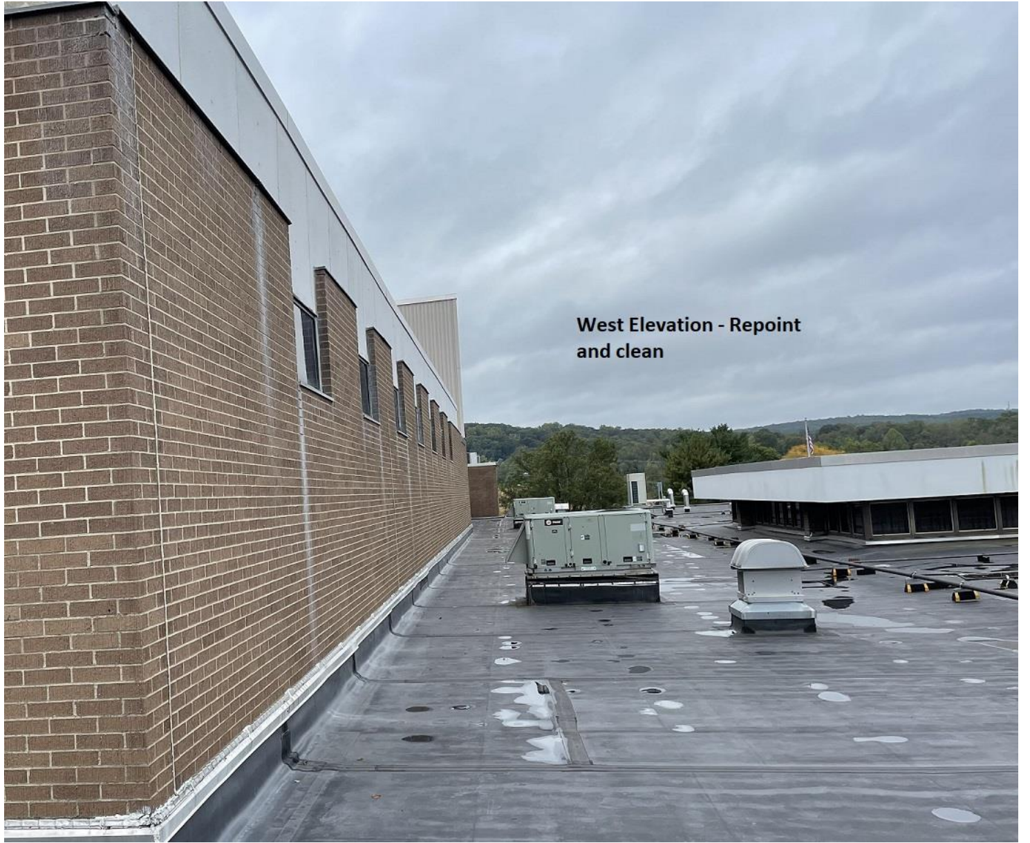
West Elevation - Repoint and clean