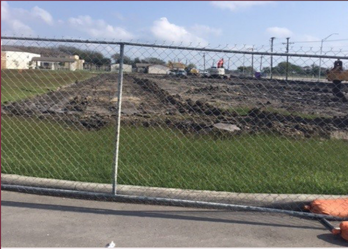
Photo 01 - View east, excavation progress at HS-MS parent drive