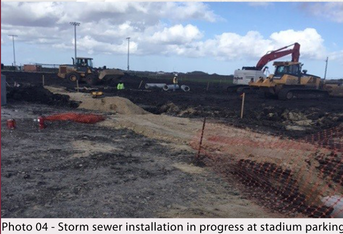
Photo 04 - Storm sewer installation in progress at stadium parking