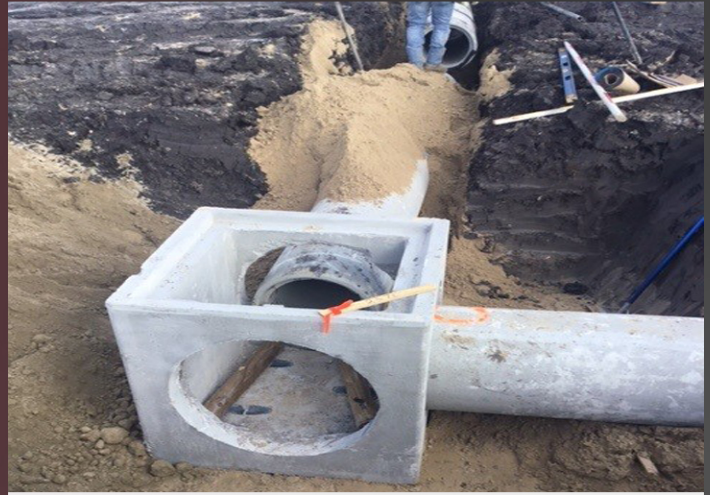
Photo 02 - Installation of new storm drainage piping