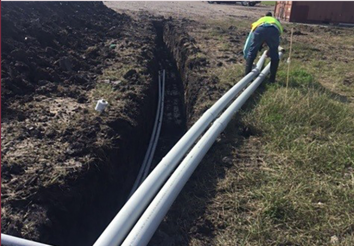
Photo 03 - Installation of data/power conduit along loop road