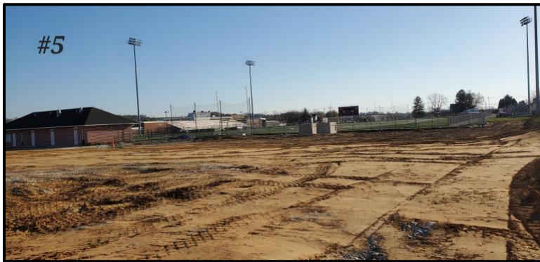
Grade level looking towards the stadium