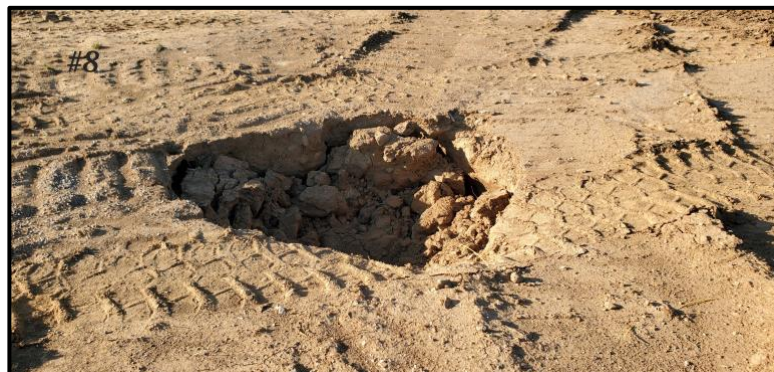
Possible sink hole