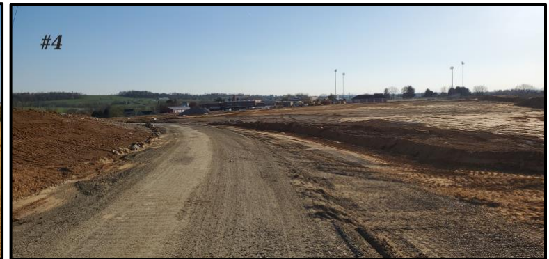
Access road between buildings