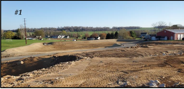
Water retention basin below storage shed

Following are pictures of the building job site: