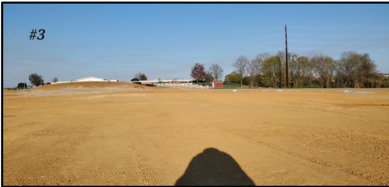
Grade level looking towards the middle school