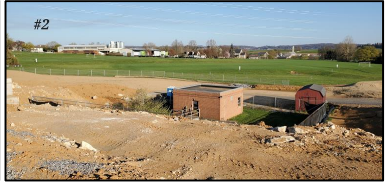
Fill around the existing sewer plant