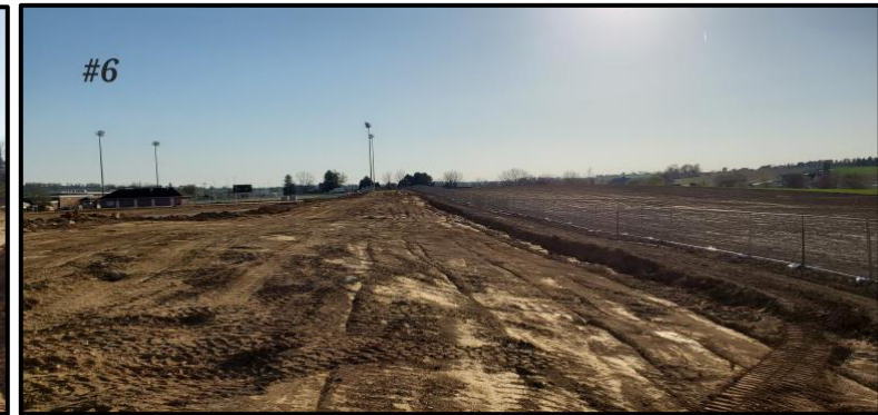
Grade along the west property line