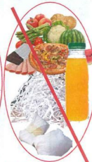
No Food, Liquids, Diapers, or Shredded Paper