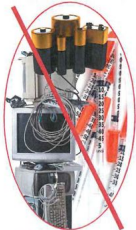
No Batteries, Electronics, or Sharps