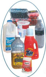
Plastic Bottles & Jugs - Caps On Jars & Tubs - No Lids No Bags, Film, or Foam