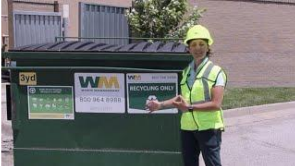
Recycling Facility Virtual Tour (5 minutes, 41 seconds)