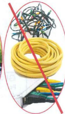
No Hoses, Wires, or Hangers