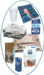
Paper Boxes, Magazines, Paper, Cups & Cartons Flatten Boxes