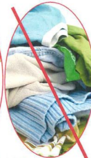
No Clothing or Shoes