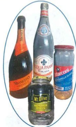
Glass Bottles & Jars No Metal Caps Metal Lids 3" plus

Put in Recycling Cart LOOSE! - Empty & Clean