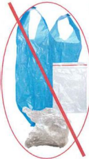
No Plastic Bags or Wrap