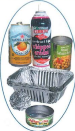
Metal Steel & Aluminum Depressurize Aerosols