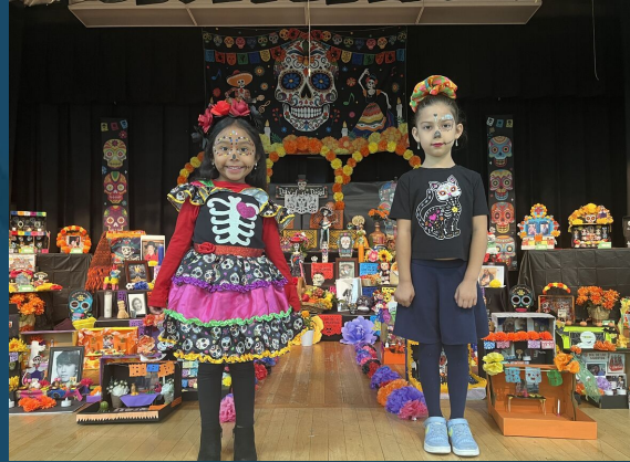
Shore Acres Elementary

Día de los Muertos ofrenda (altar) at the Willow Creek Center to highlight Mexican culture and influential Mexican educators titled "Latinx Legacy in Education."