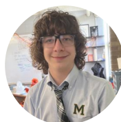
Written By: Riley Piazza

stores in the area. Target is one of the best stores to shop at during black Friday, not only for the deals, but they host their black Friday deals weeks in advance. Every day there are new products with more savings. They also have up to 50% off on books, clothing, and other household items. Old Navy is very popular and they have deals on their clothing. The sale starts at 4pm on thanksgiving day and everything in the store is 50% off. Some items can be as low as $5. Even Amazon has Black Friday sales, you can save up to 70% on tech items, 30% on kindles, and up to 50% on other items. And the final store you might want to stop into is Barnes and Noble, they have 50% off on most items in the store including books, magazines, accessories, and music related items.