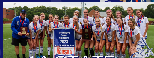
NCHSAA 1A/2A STATE CHAMPIONS