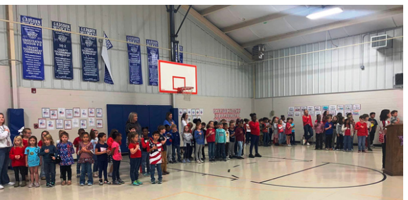
Above: At Gadsden Elementary, students prepare to say the Pledge of Allegiance to open their program.

Following are some of the scenes from the various programs offered throughout the county school district.