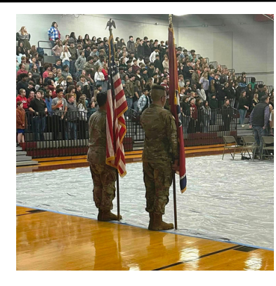
Above: At the high school, students ready for the presentation of the colors prior to the beginning of their Veterans Day assembly.

Right: This display in the Middle School honored four CCMS employees for their service to our nation.