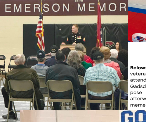
Below: Some of the veterans in attendance at the Gadsden program pose with students afterward for a memento.