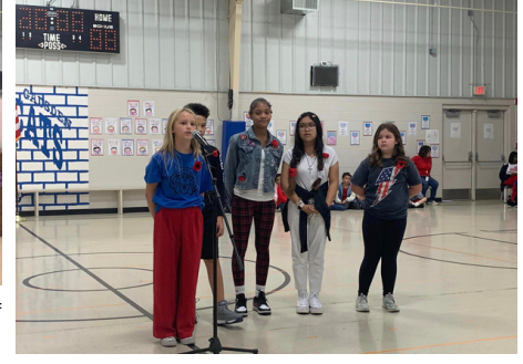
Above: Fifth-grade students paid tribute to the veterans during the GES program.