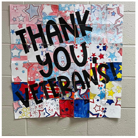
Above: This colorful sign welcomed the veterans at Crockett County Middle School.