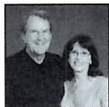
Lloyd & Laurie Carr

The Lloyd & Laurie Carr Scholarship extends an award of $4,000 to two outstanding freshman applicants to the University of Michigan - Ann Arbor. The Lloyd & Laurie Carr Scholarship does consider economic need , (as determined by the Office of Financial Aid at the University of Michigan).