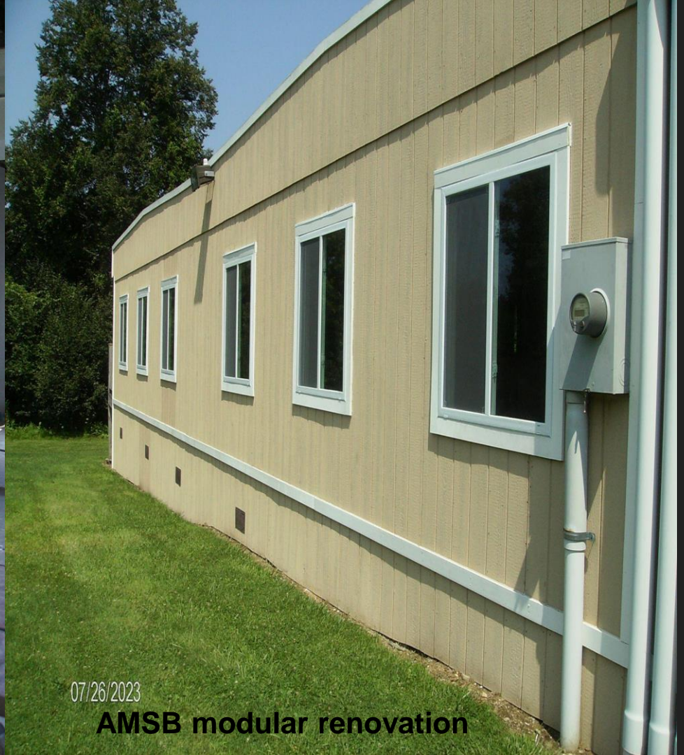
AMSB modular renovation