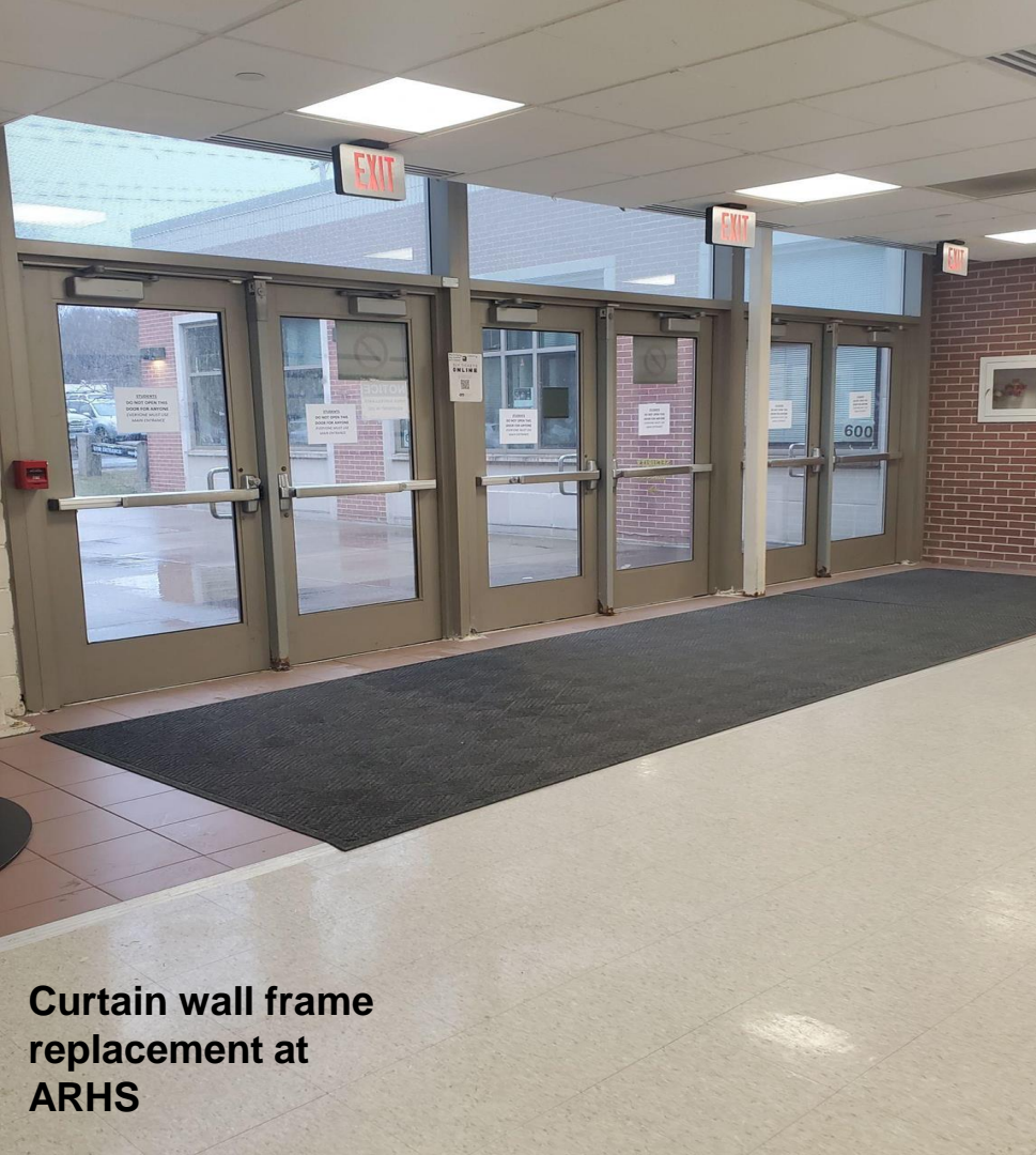
Curtain wall frame replacement at ARHS