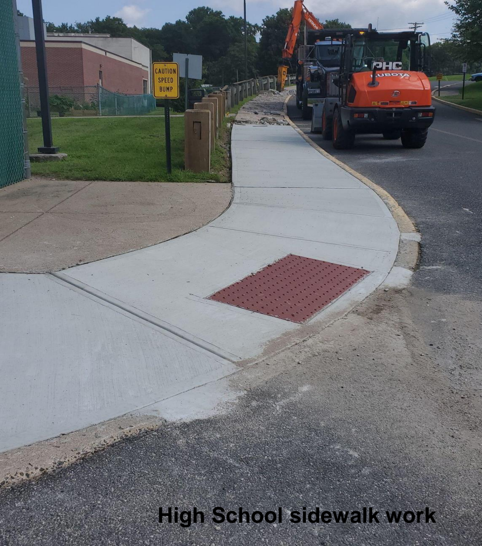
High School sidewalk work