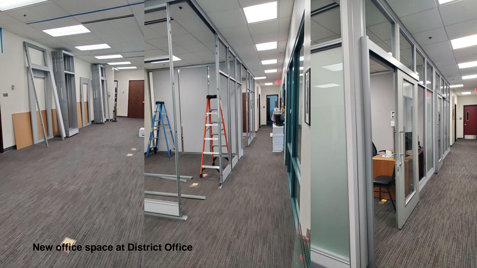
New office space at District Office