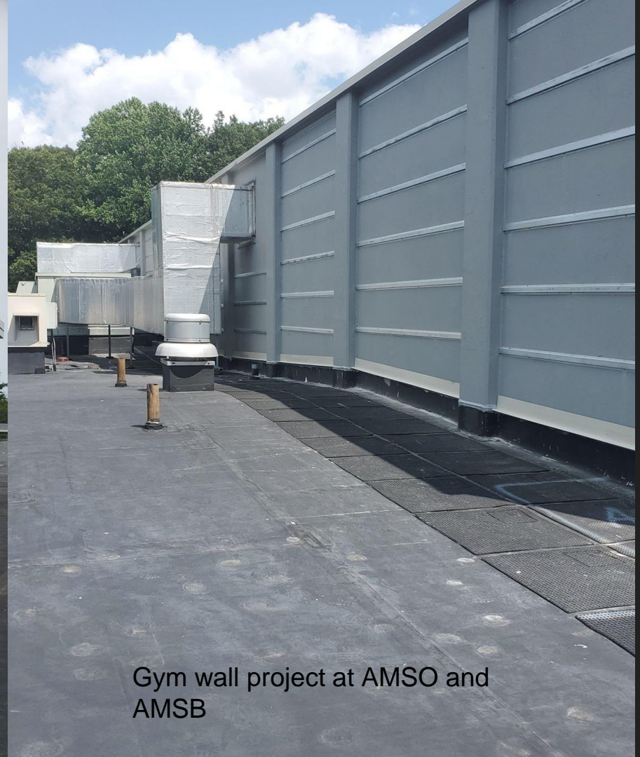
Gym wall project at AMSO and AMSB