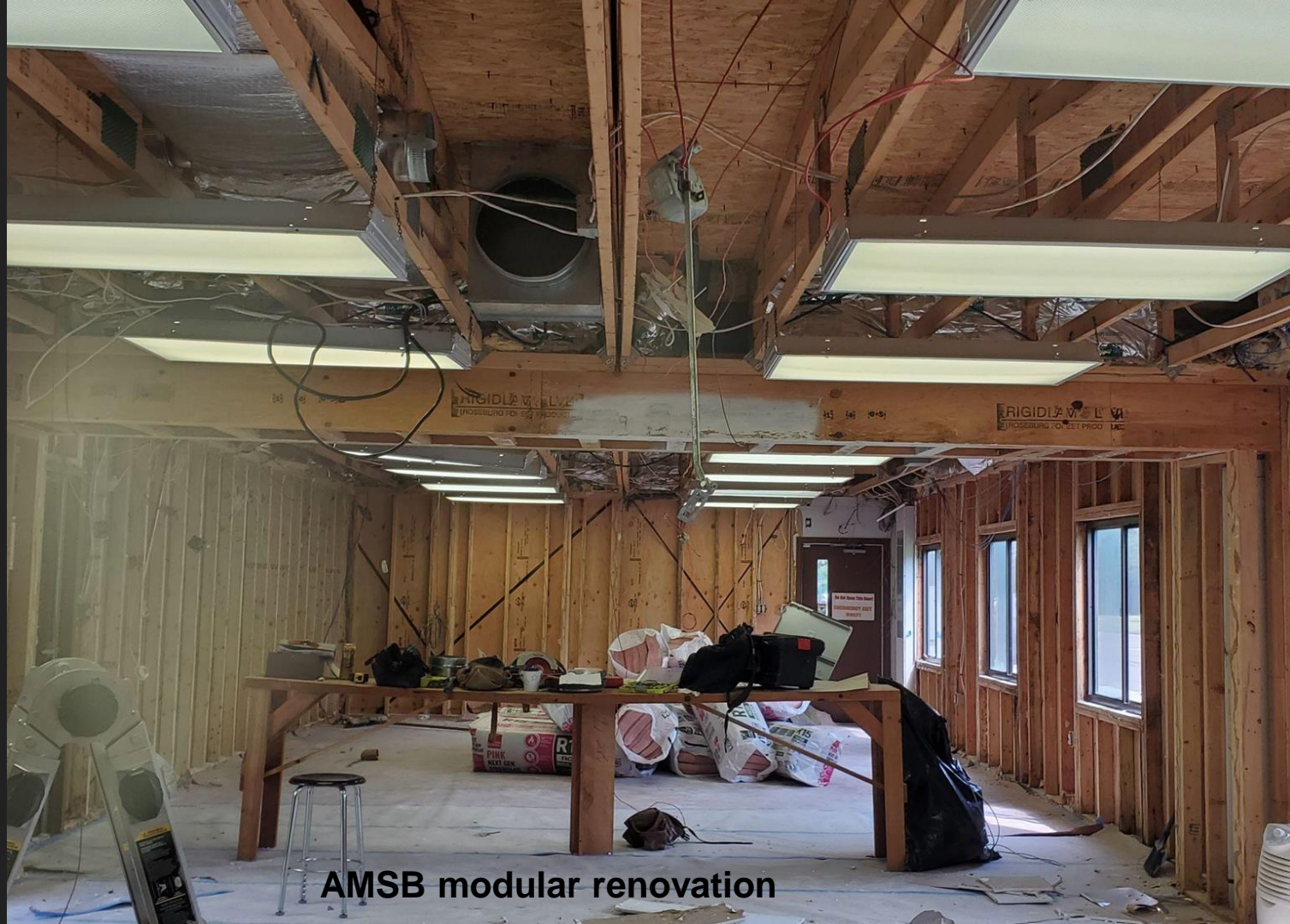
AMSB modular renovation