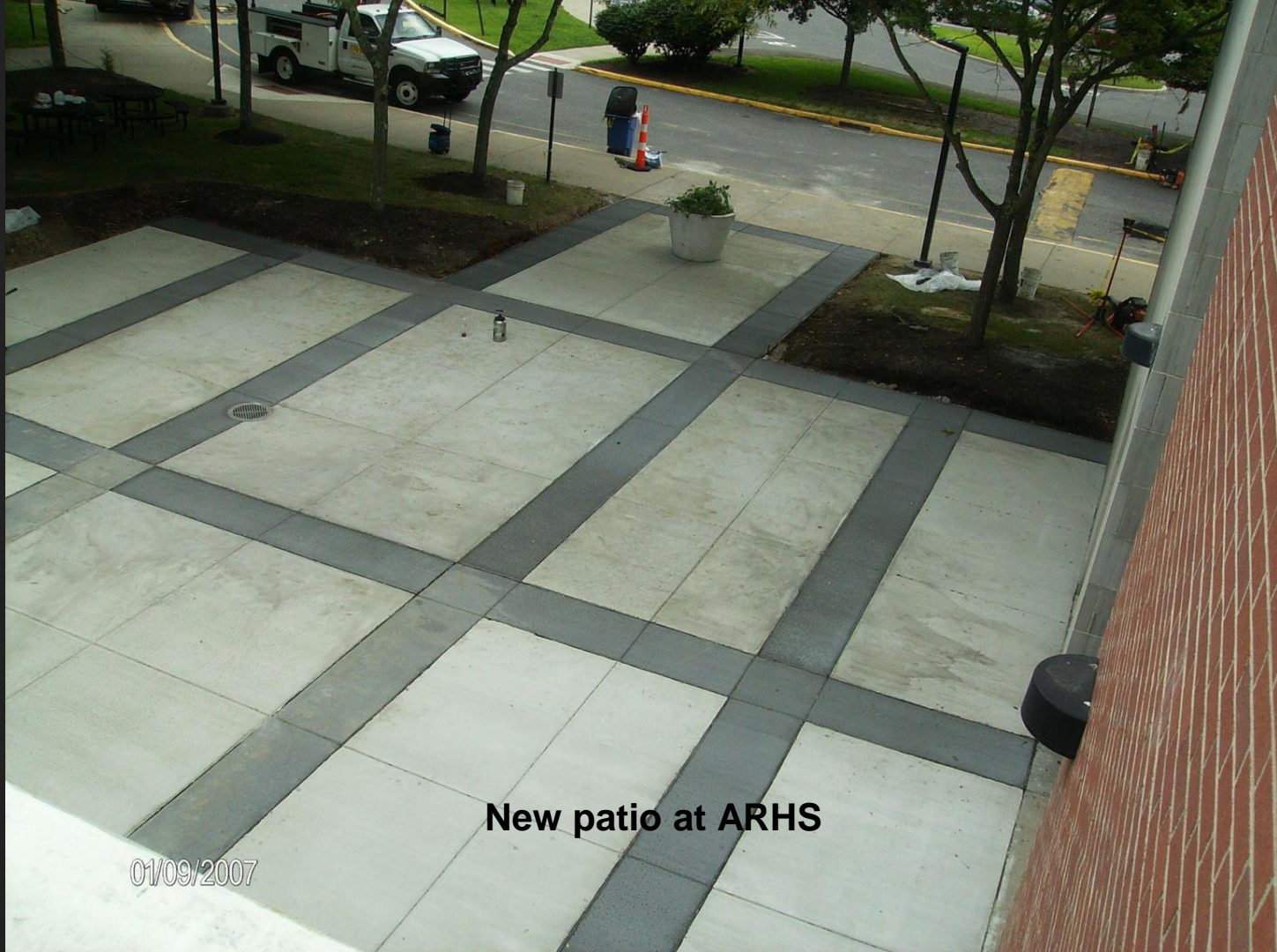
New patio at ARHS