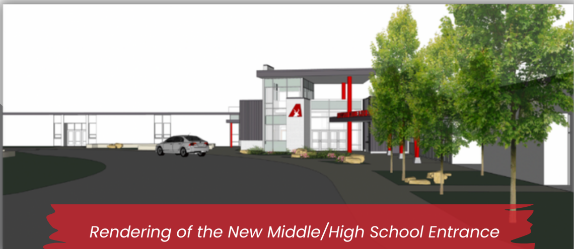
Rendering of the New Middle/High School Entrance

Although school and how our students access materials for learning have changed, we have heard and listened to parents and students who have expressed concerns about needing to carry items during the school day and where students will hang jackets.