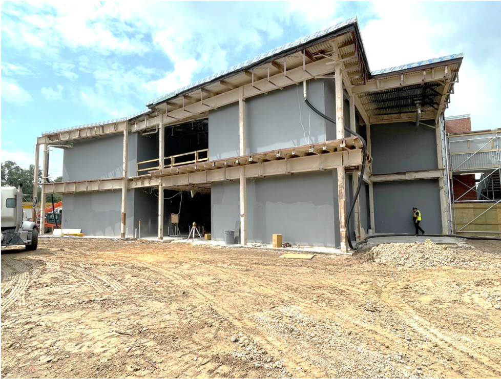
Demolition complete at classroom wing