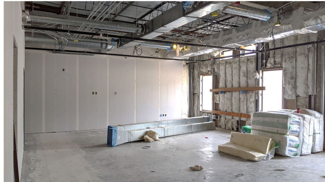
Classroom addition underway in renovated library