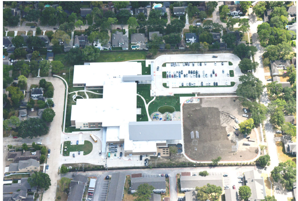
Current - Aerial view as of September 2023