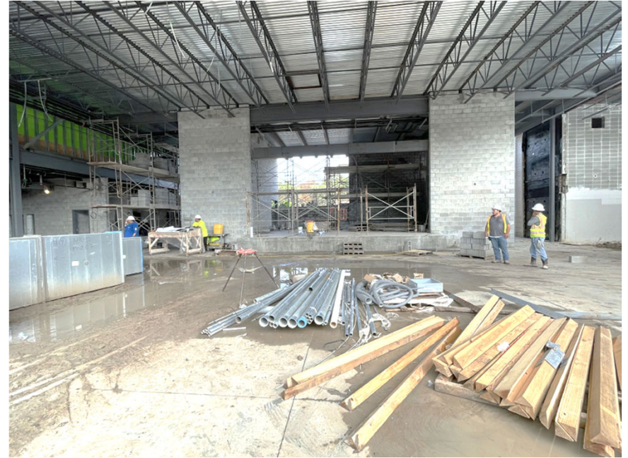
Cafeteria view toward stage. Kitchen servery on the left.