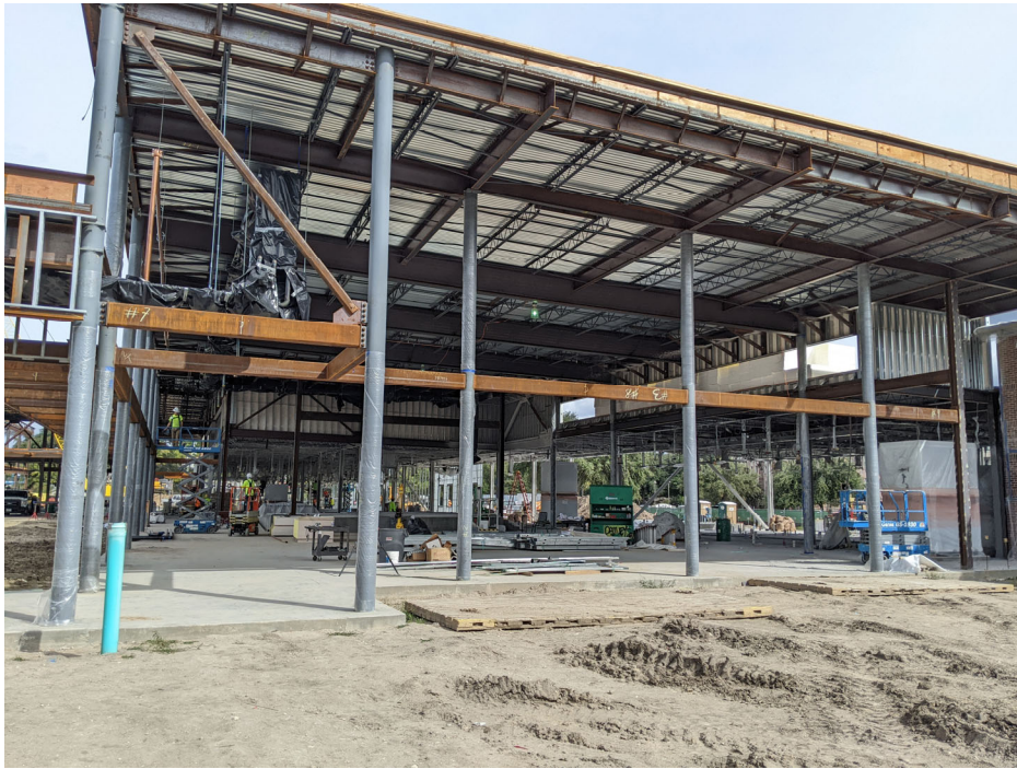
View of cafeteria from bus drive