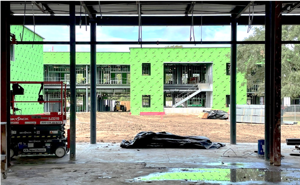
View from Administration Wing across central courtyard to Learning Stairway