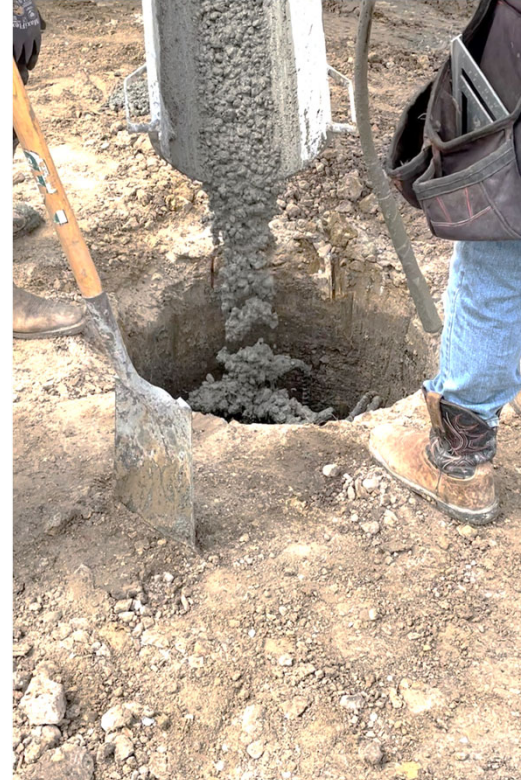
Concrete pier installation