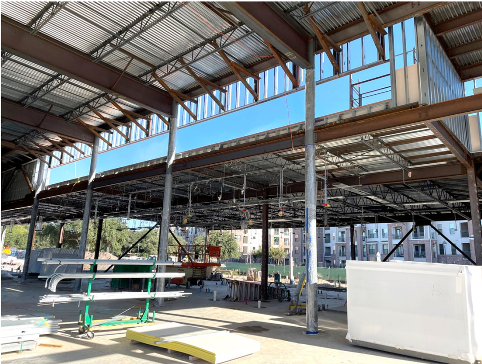
Clerestory opening at cafeteria