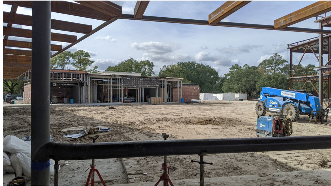
View of central courtyard with renovated library beyond