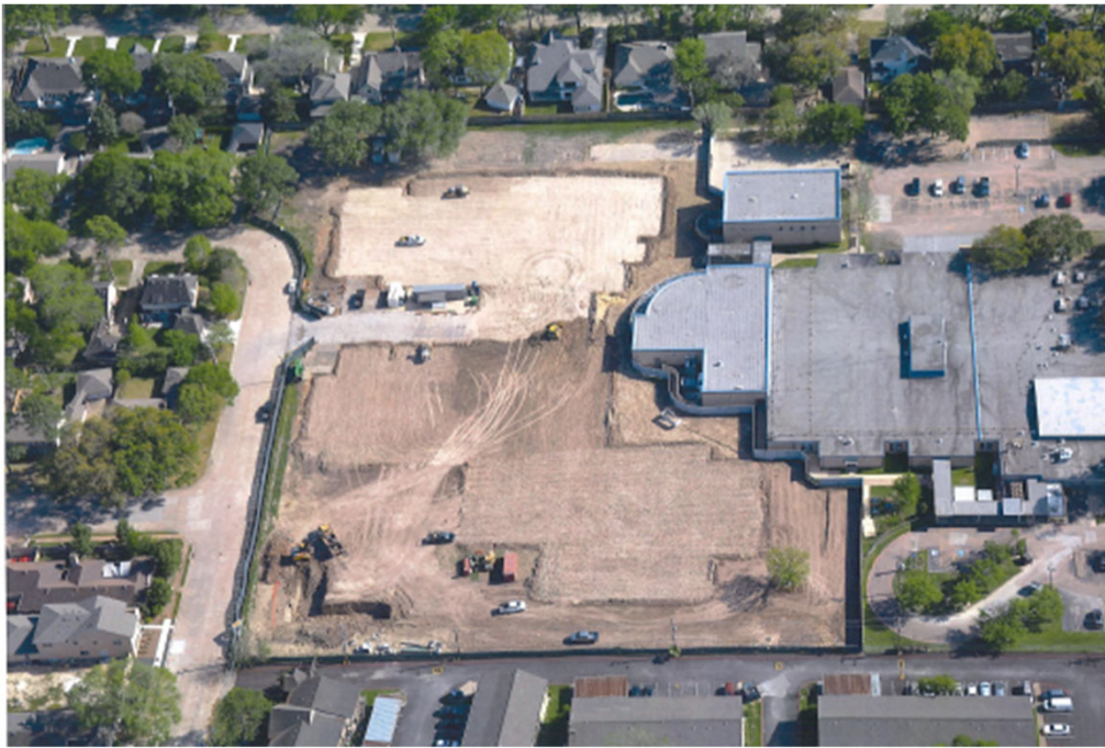
Before - Aerial view from May 2022