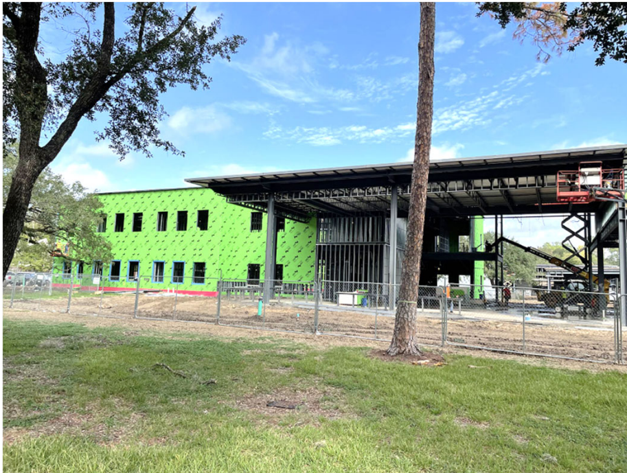
Two story Academic Wing on the left in green sheathing and library steel framing on the right