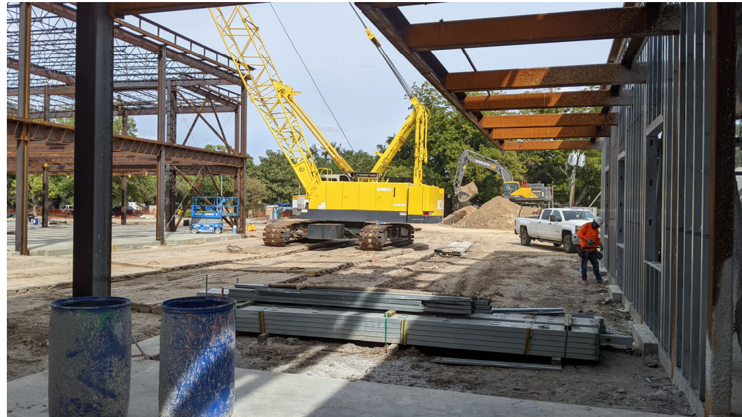
East view from future front entry