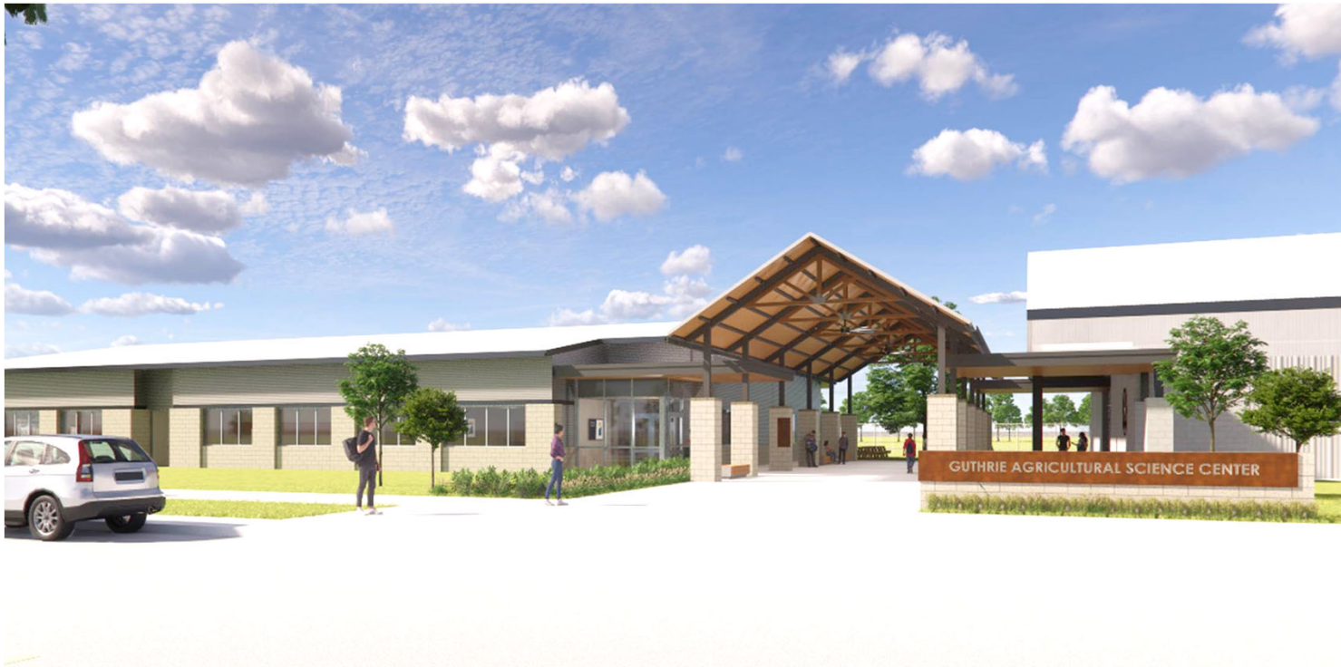
Rendering of proposed front entry