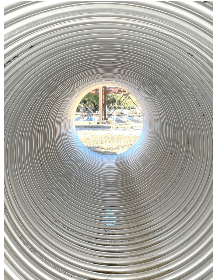
View from inside storm detention pipe