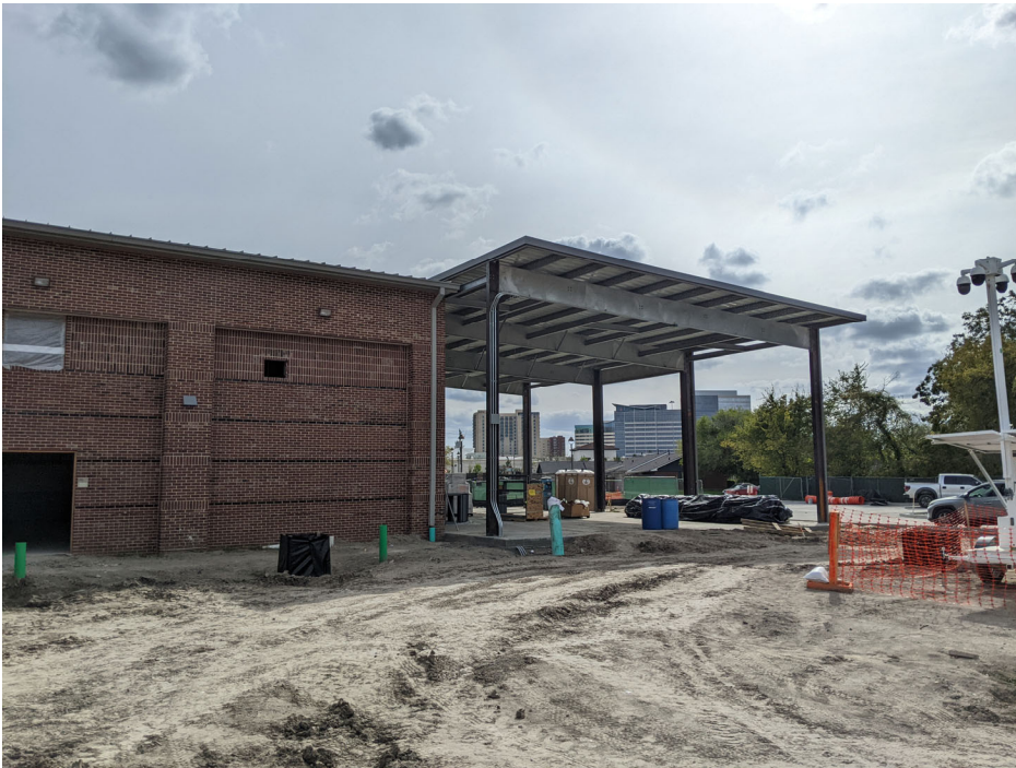
New covered play area adjacent renovated gymnasium