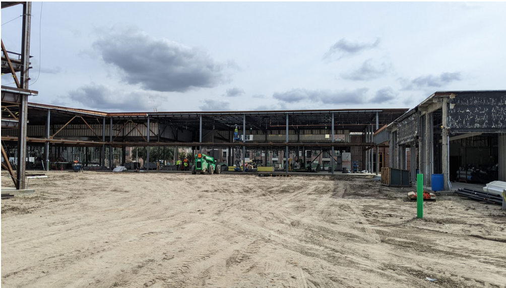
View of central learning courtyard