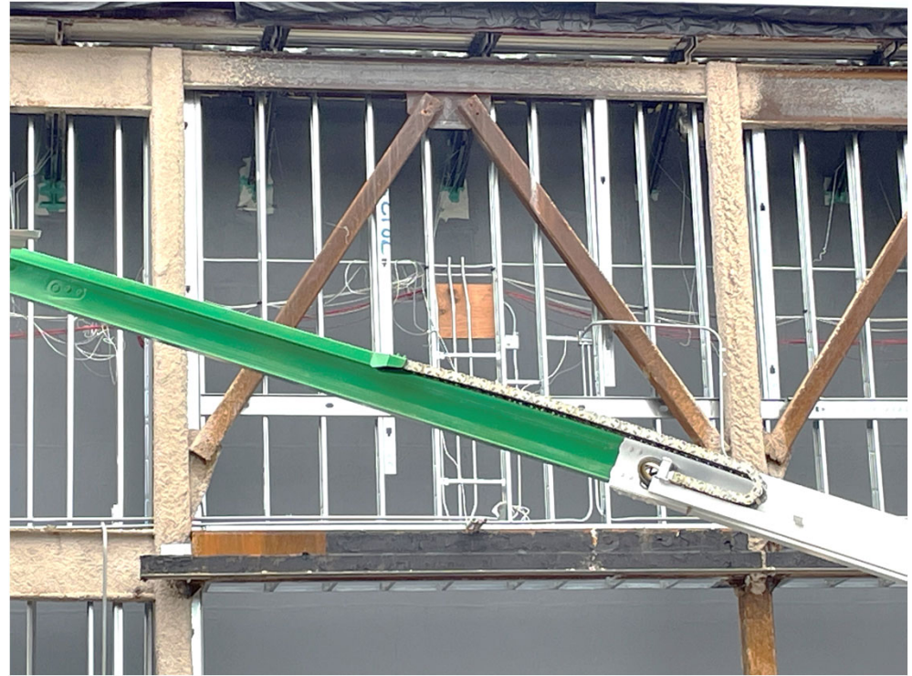
Partial demolition at cafeteria