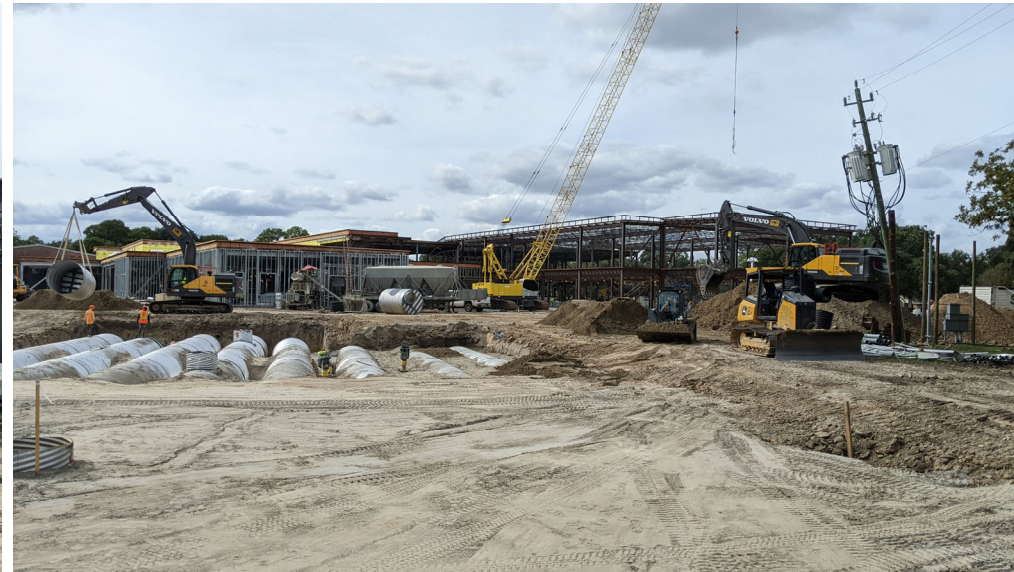
View of new campus from Bunker Hill Rd.