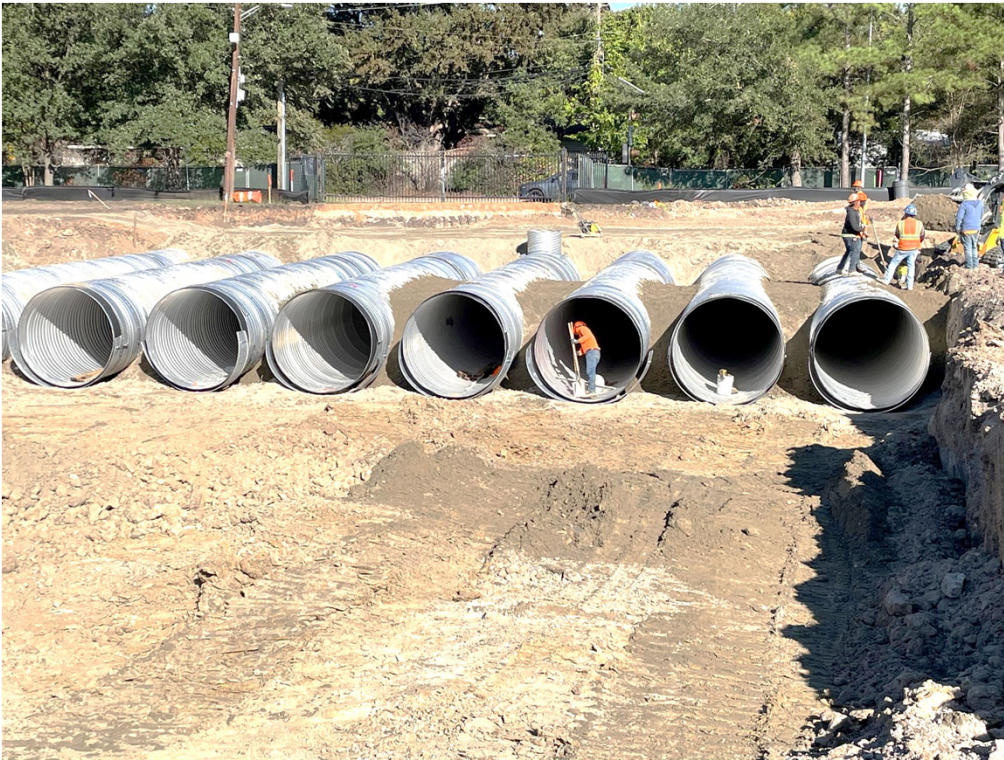
Storm detention pipes