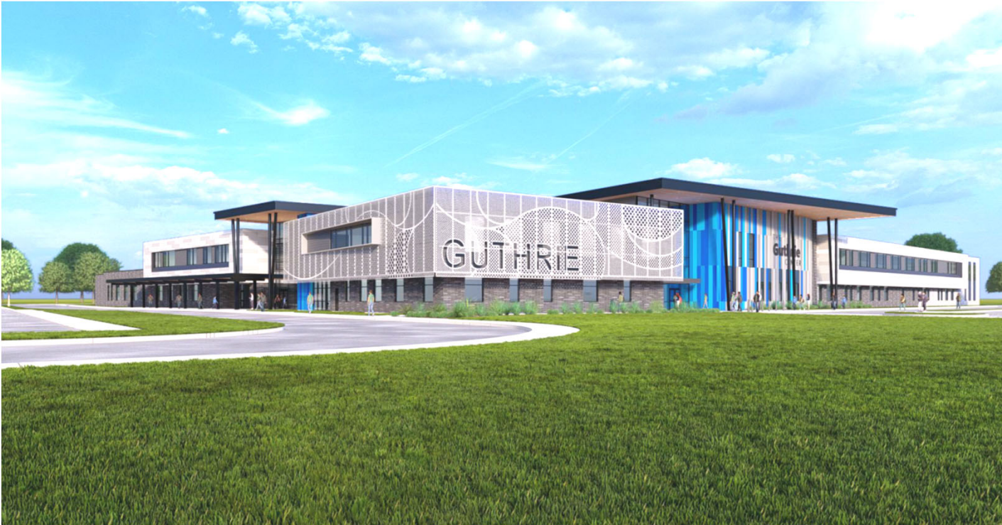
Rendering of proposed corner view of building