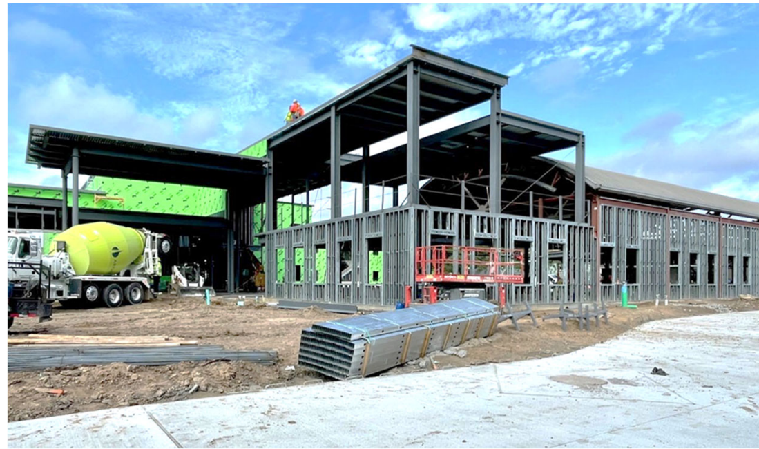
View from parents drive toward main entry. Repurposed library into new administration area on the right.