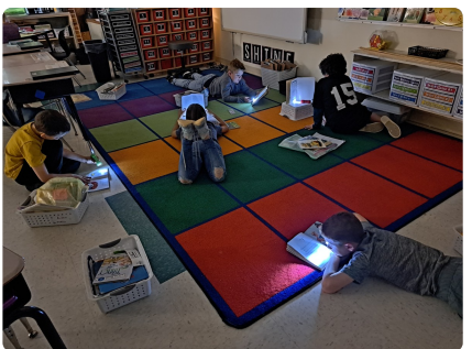
2nd Grade - Independent Reading