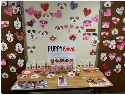
4PK 100 Doggie Donations

What an amazing turn out of 100th day projects! I'm so sorry that I missed this event due to a family emergency. I've enjoyed seeing all the pictures taken!