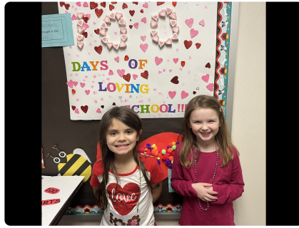
100th Day Projects