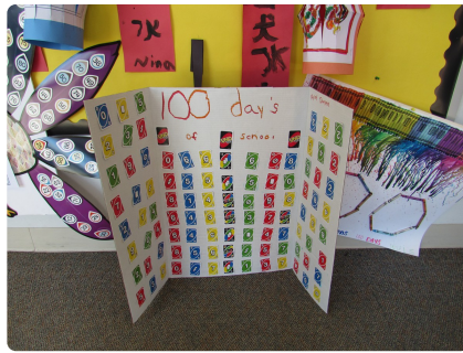
100th Day Projects