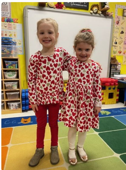
I Heart You