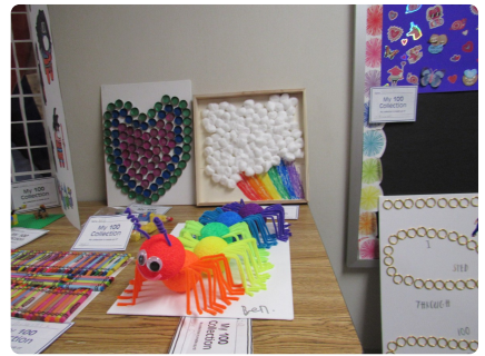
100th Day Projects