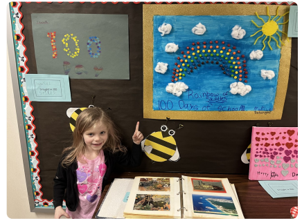
100th Day Projects