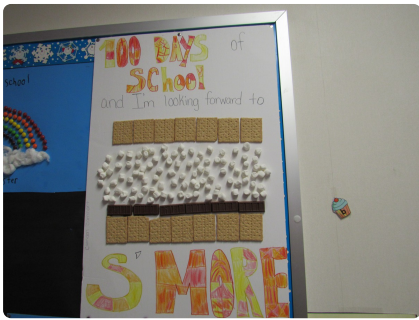
100th Day Projects