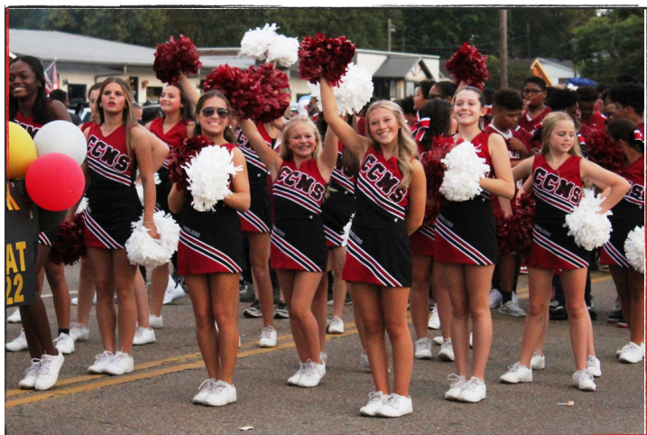
Below: The middle school cheerleaders were there to help get the crowd revved up.