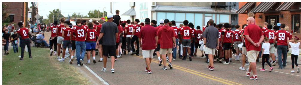
Above: Football players were there as well.