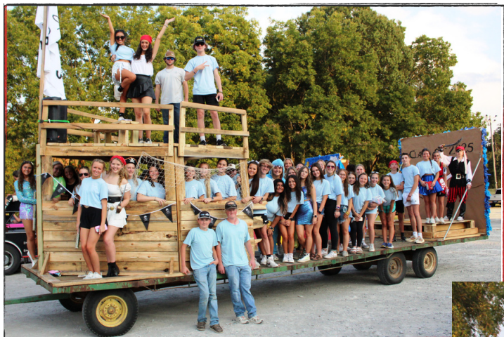
Above: The juniors amazed the crowd with their pirate ship.