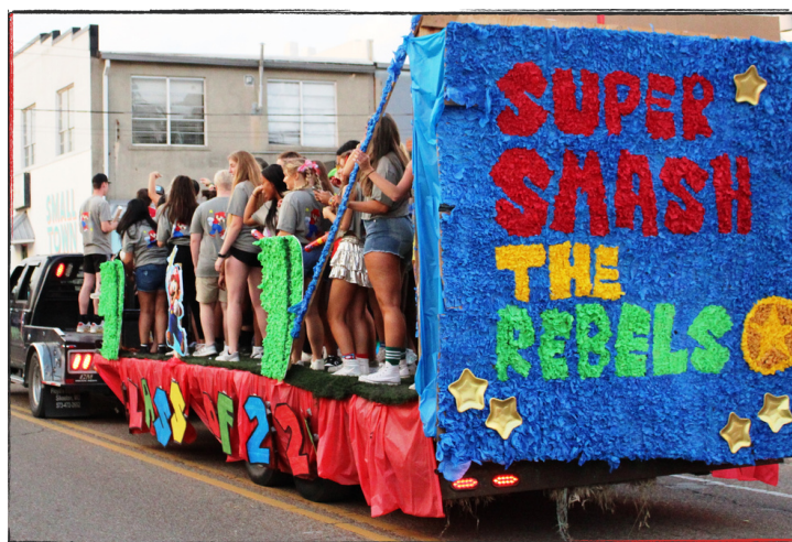
Above: The colors were amazing on all the float backs.