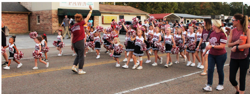
Below: There were tiny cheerleaders too.