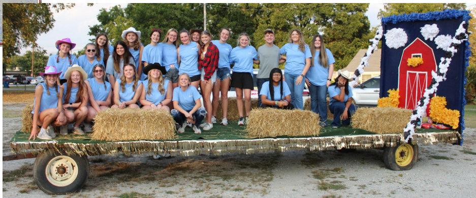
Below: The freshmen class float, while relatively calmer than the others due to its agricultural theme, still had some folks who were ready to wrangle.