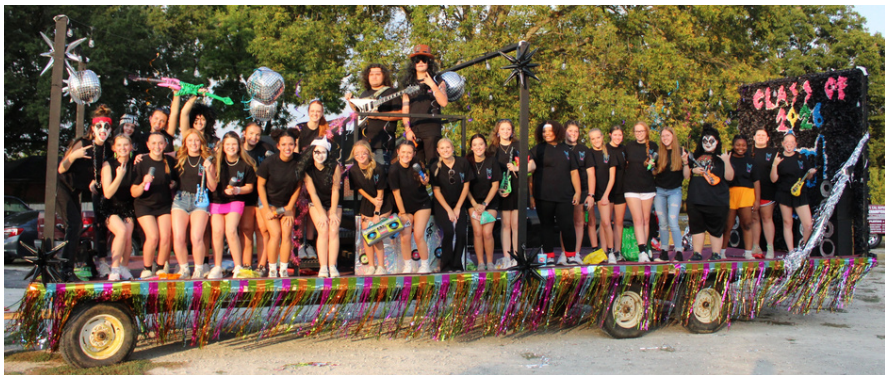
Above: The crowd was plenty revved by the time the sophomores cranked up "I Love Rock and Roll."