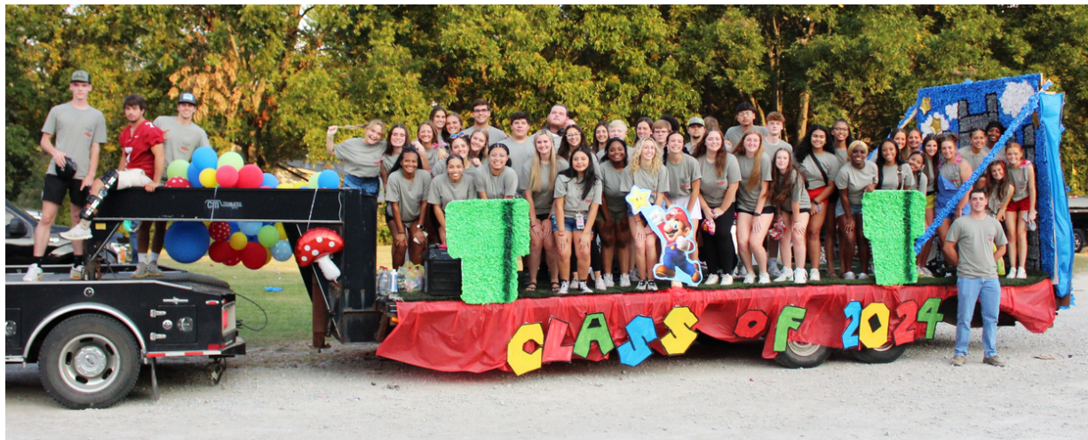
Above: Ready to super-smash it: the senior class stepped up.