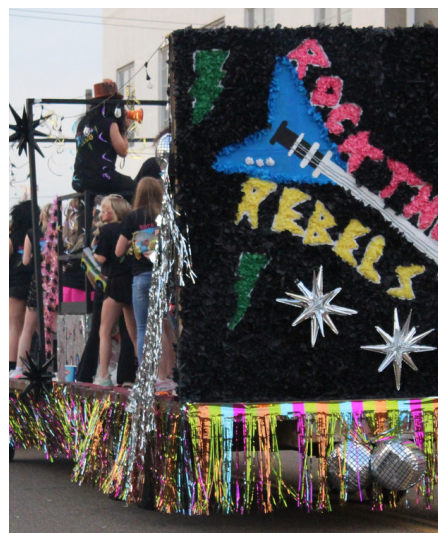
Left: The sophs had the square rockin'.