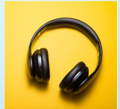
Sounds & Music

Click on any of the pictures to explore more!