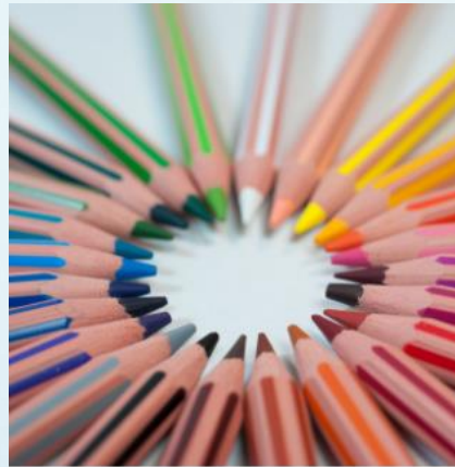
Coloring & Creativity