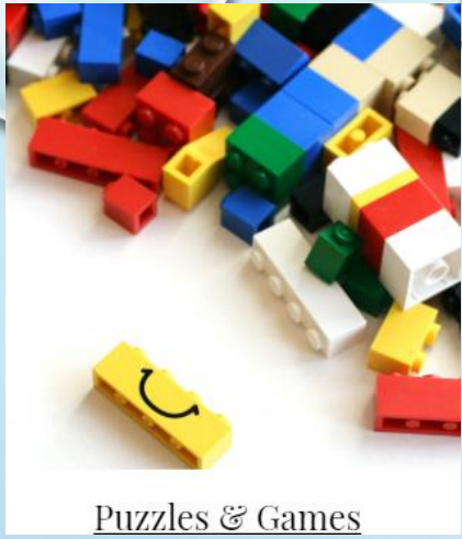
Puzzles & Games