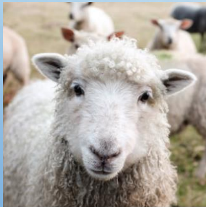
Live Animal Cameras

Click on any of the pictures to explore more!