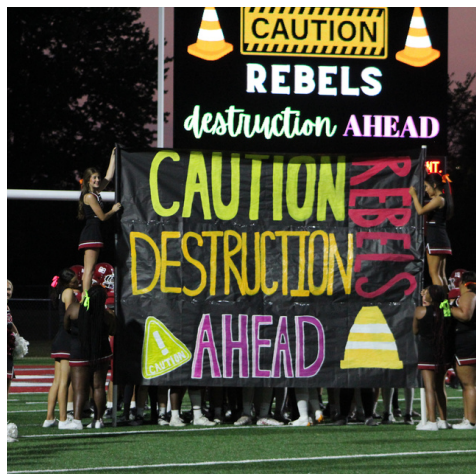
Above: The Crockett cheerleaders are forecasting doom for the visiting Obion County Central squad.