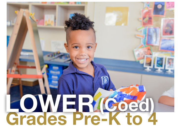
LOWER (Coed) Grades Pre-K to 4

The Academy's lower division provides a safe community where students feel a sense of belonging, allowing them to thrive as they begin their learning journey. We nurture well-rounded students who are curious learners by helping your children develop intellectually, spiritually, socially, emotionally, and physically. The lower school prioritizes teaching social-emotional skills to foster positive relationships, emotional management, collaboration, and responsibility.