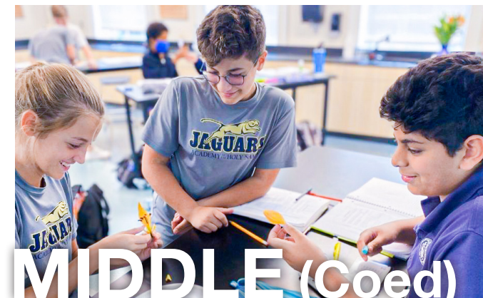
MIDDLE (Coed) Grades 5 to 8

Our middle division offers a challenging and engaging academic program where we emphasize high-level critical thinking and executive functioning skills. Our community of experienced and passionate teachers apply a hands-on approach to learning that encourages students to be confident, engaged learners who emerge well-prepared for high school.