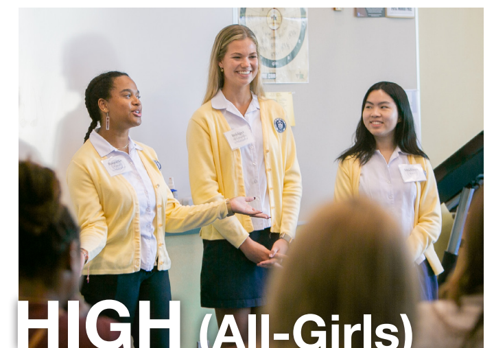
HIGH (All-Girls) Grades 9 to 12

At the Academy, we believe in the transformative power of an all-girls high school education. We have cultivated an environment where girls can flourish academically, socially, and personally to reach their God-given potential. Our rigorous curriculum encourages students to embrace their strengths, develop leadership skills, and become confident, compassionate individuals who are ready to make a positive impact on the world.