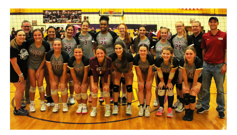
Above: Headed for Murfreesboro...