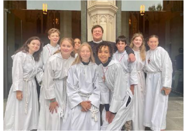
Our acolytes had a wonderful experience at the National Acolyte Festival in Washington, DC!

Sunday, December 3 - 5:00 - 7:00 PM. Drive Thru Nativity. Youth are needed to volunteer for the sheep and shepherd scene for this community event.