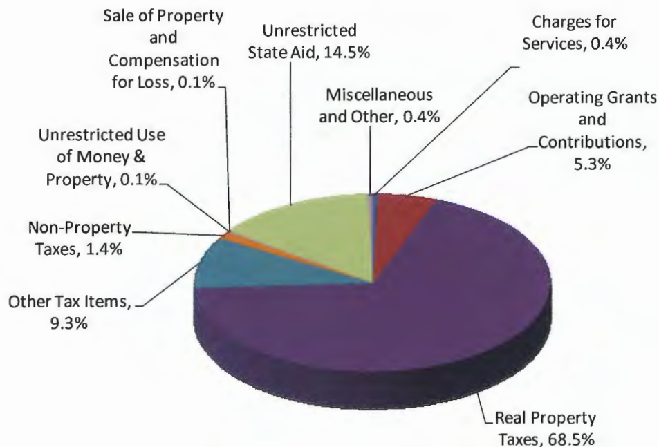
Sources of Revenue for Fiscal Year 2019 Governmental Activities