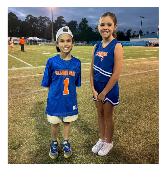
Honorary Captains at the game against Bayside Academy on October 13th.