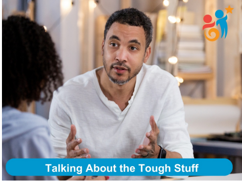
Talking About the Tough Stuff