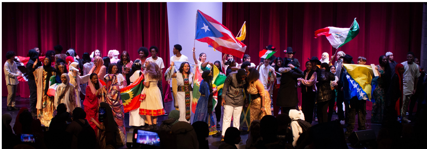
The Fridley High School Culture Day participants gather on stage after the performance.

At the end of the program, all participants gathered on stage waving their respective national flags to a standing ovation from the audience.