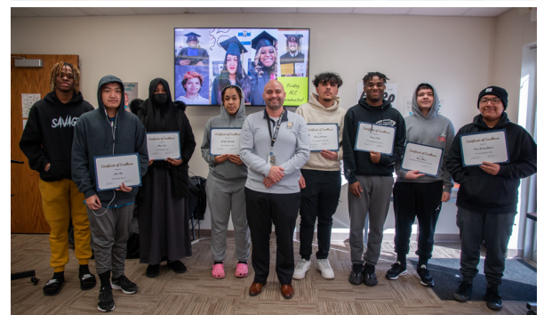
Top to bottom: the morning ALC student award winners and the afternoon ALC student award winners.