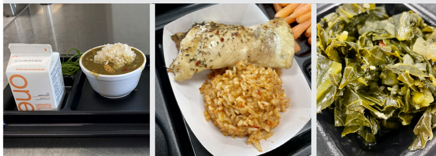
Left to right: beef andouille sausage gumbo, Jollof rice with jerk chicken and collard greens.

excited to try some new recipes that we now hope to incorporate into our year-round menu."