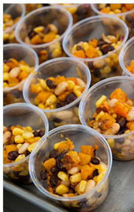
Left to right: wojapi, wild rice salad and three sisters salad.

Wild rice is of great historical, spiritual and cultural importance to the Ojibwe people. Minnesota has more acres of natural wild rice than any other state in the country and it has been historically documented in 45 of Minnesota's 87 counties and in all corners of the state. The wild rice salad included wild rice, locally sourced apples, cranberries, maple syrup and a few other ingredients.