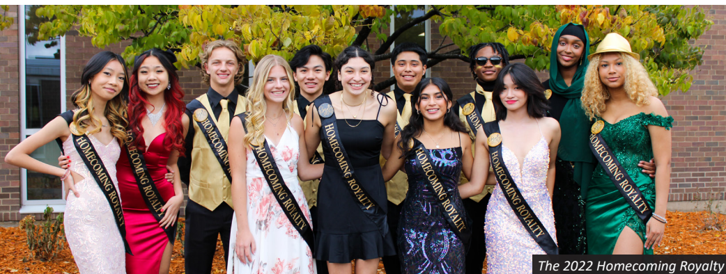
The 2022 Homecoming Royalty