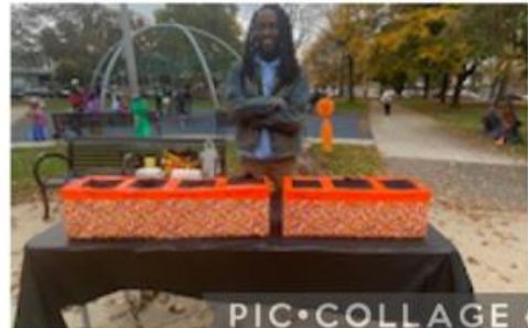
Report Period 1 Kickboard Incentive Field Trip to SkyZone