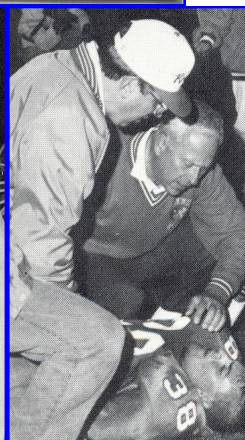
1979, 1984, and 1992—Serving as Team Physician