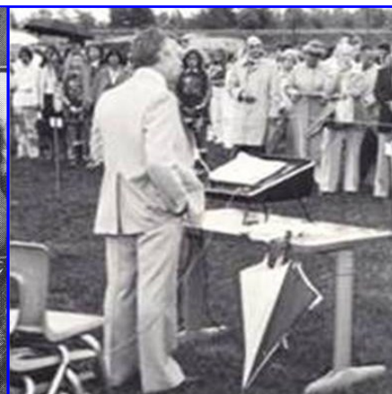
1979—Field House groundbreaking ceremony as Booster Club President