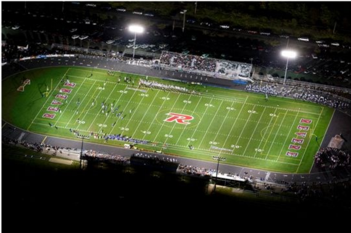
Joseph F. Pappano Stadium