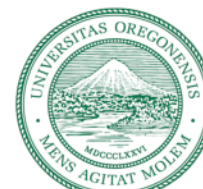
University of Oregon