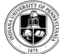
Indiana University of Pennsylvania