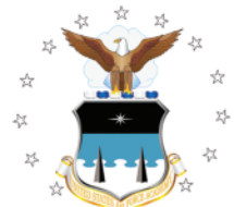
The United States Air Force Academy