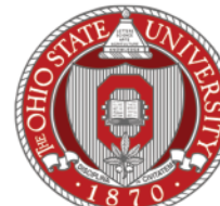
The Ohio State University