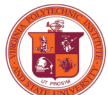
Virginia Polytechnic Institute and State University