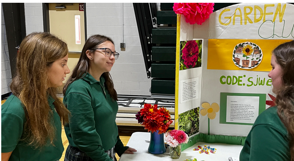
Students peruse more than 20 clubs and organizations at the annual Club Fair.