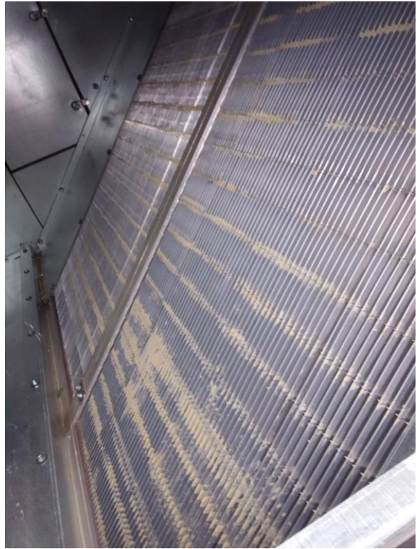
RTU1 Heat Wheel