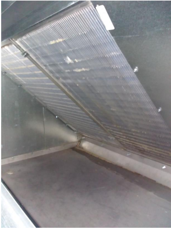
RTU1 Heat Wheel