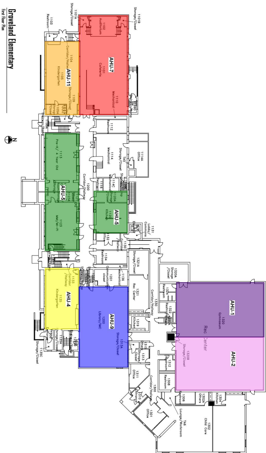
Groveland Elementary First Floor Plan