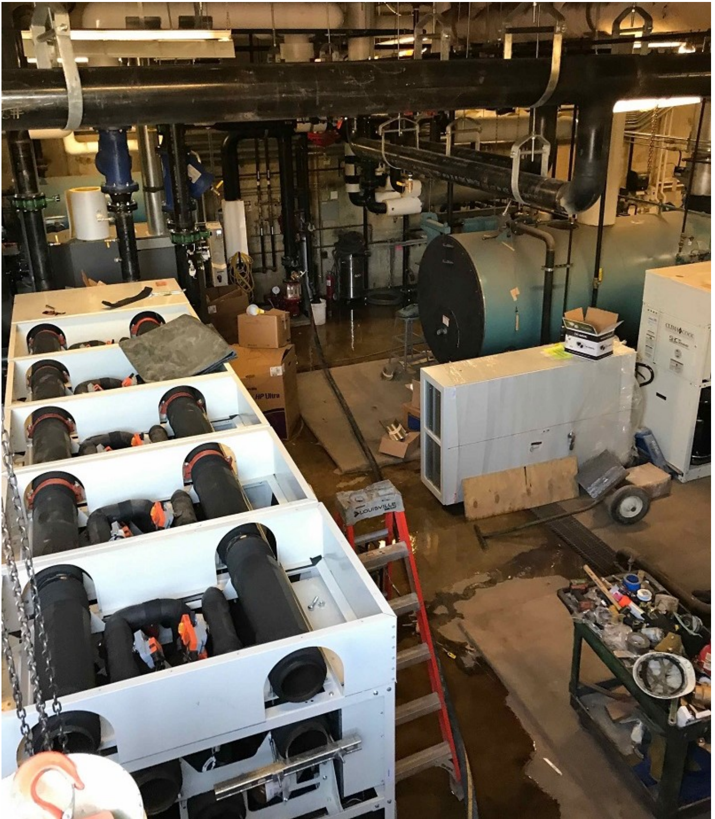
New heat pump that will be put in service fall 2022 along with the geo-thermal well field (February 2022)