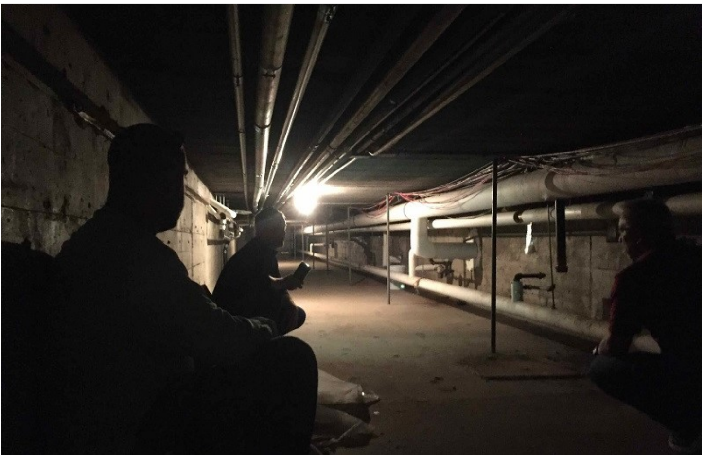
Current student pick-up/drop-off; contractors view the plumbing tunnel under the school's main corridor (May 2022)