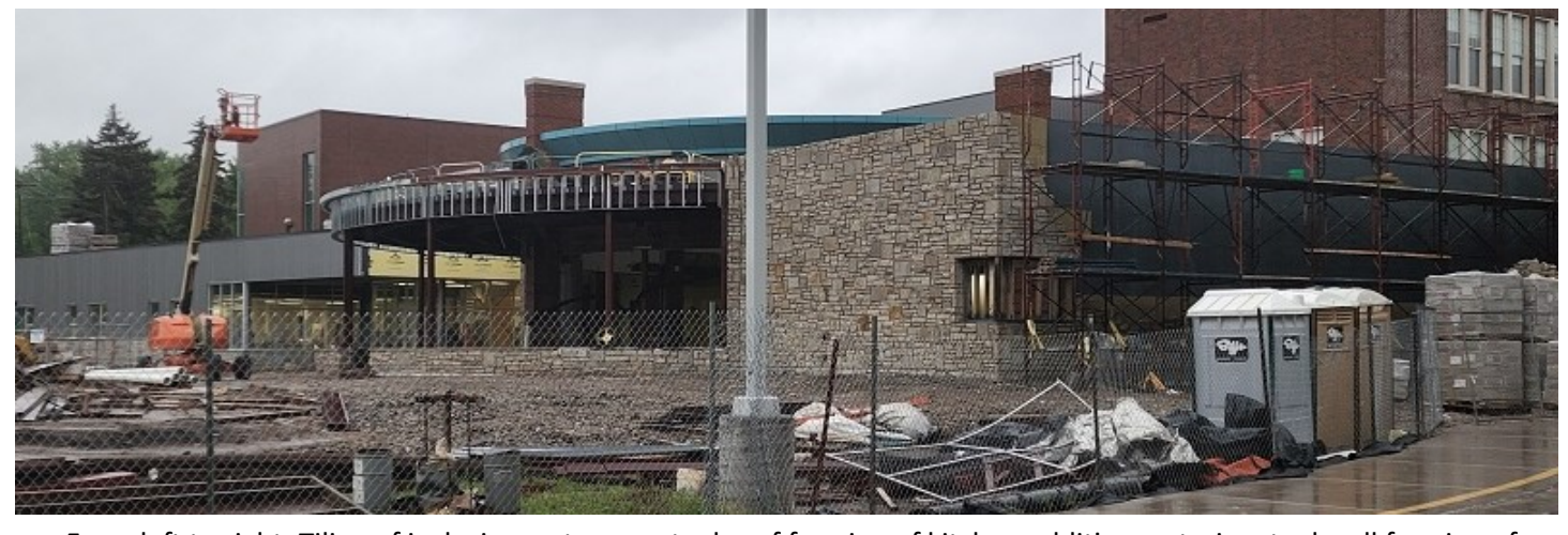
From left to right: Tiling of inclusive restroom; steel roof framing of kitchen addition; exterior steel wall framing of Circle Space; stone veneer for exterior of kitchen addition (May 2022)