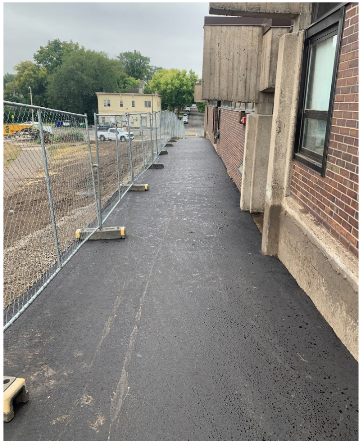
From top left: Groundbreaking event on September 28; grading for new egress path; finished egress path (September 2023)