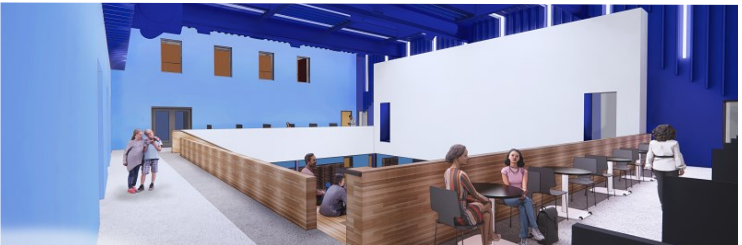
From top, then left to right: Cafeteria looking toward media center doors; new main entry with stairs to second floor; learning commons in building's classroom area; view down hallway looking towards flex classroom, image also shows color wayfinding; media center learning stair connected to cafeteria (April 2023)