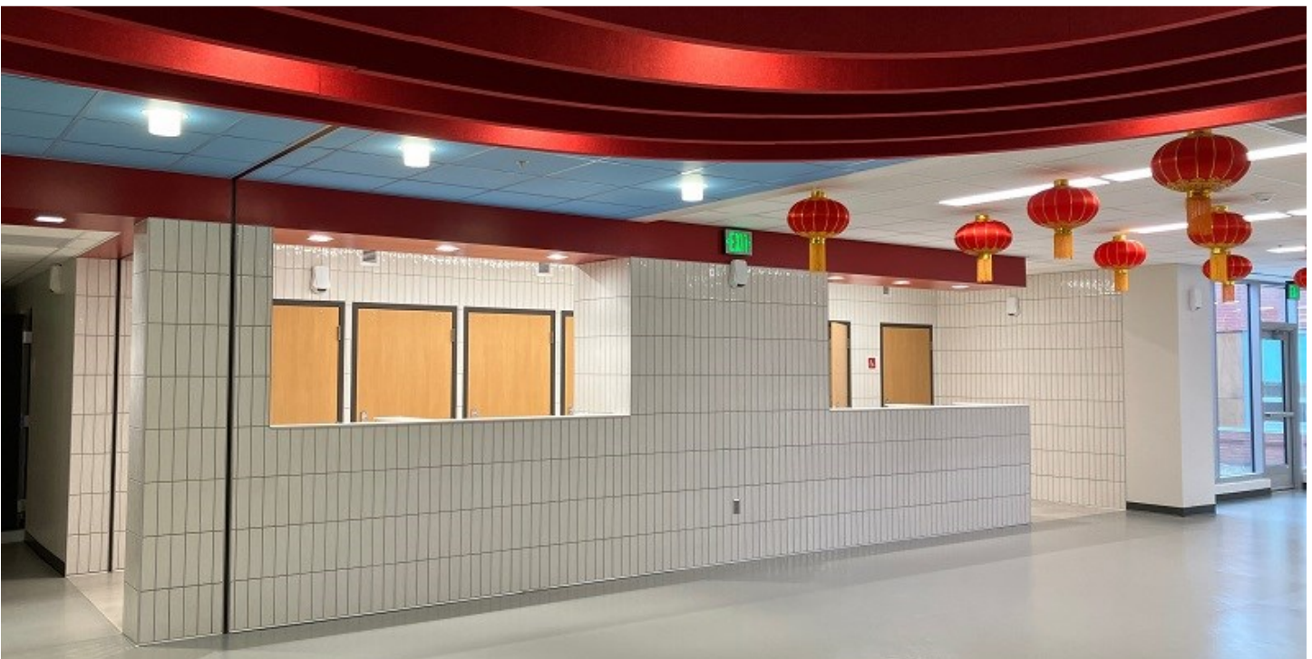
From top left: Ribbon cutting on September 29; cafeteria and food service area; school entrance with Moon Gate at right; "Tiger's Lair" serves as student informal learning and gathering space; inclusive restroom (September 2023)