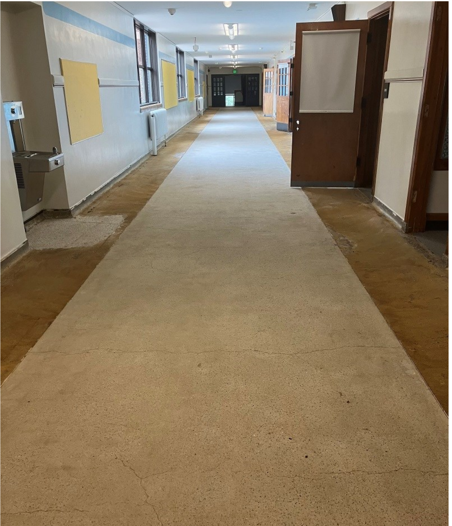
Hallway after asbestos abatement (September 2023)