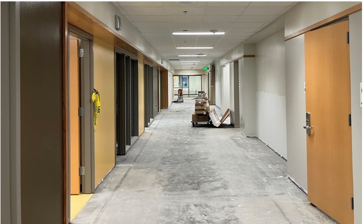
From top: New carpeting installed in second-floor medium group room; flooring prepped for rubber tile installation (September 2023)